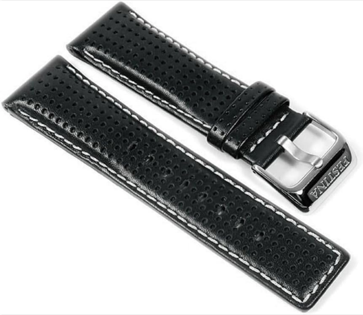
Figure 1: Festina F16363/3 Leather Watch Strap. This image displays the black leather strap with white stitching and a silver-tone buckle, showcasing its perforated design.