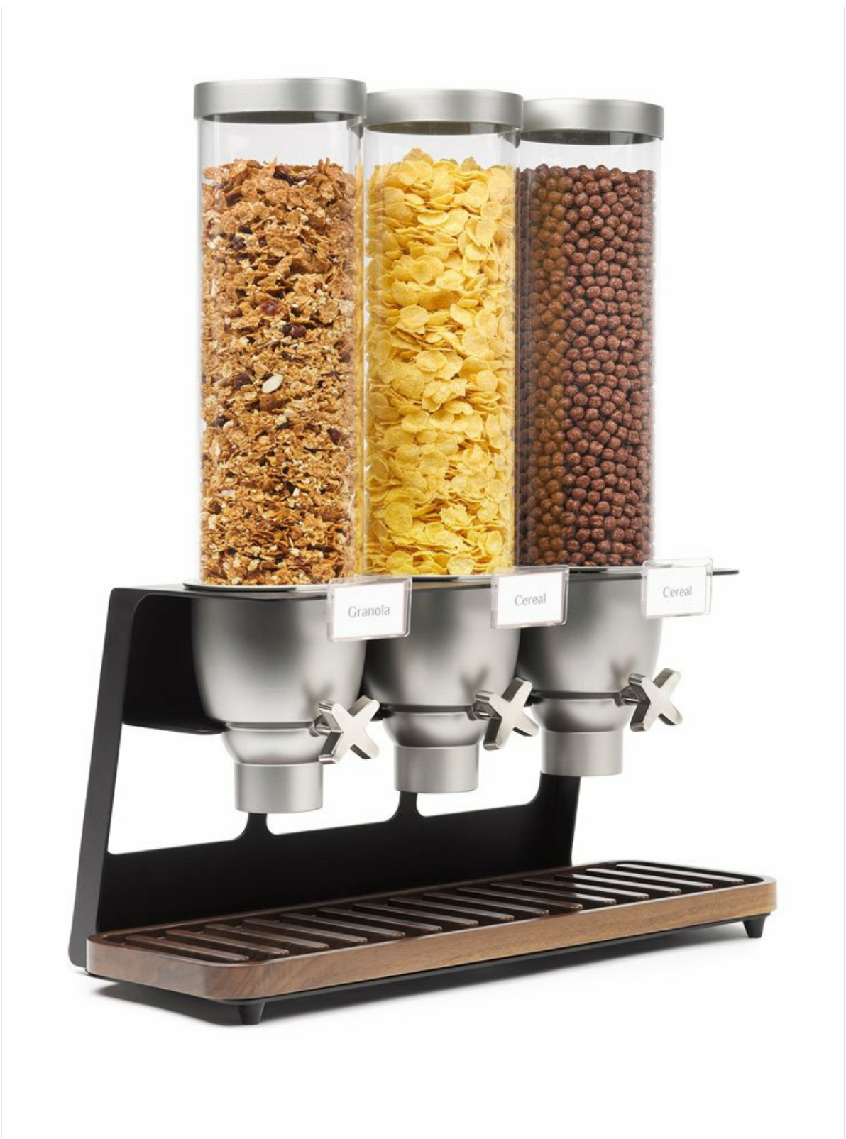
Figure 1.1: The Rosseto EZ-SERV EZ520 Triple Cereal Dispenser shown in a commercial buffet environment. This image displays the dispenser with three clear acrylic containers filled with various cereals, mounted on a black steel stand with a walnut base.