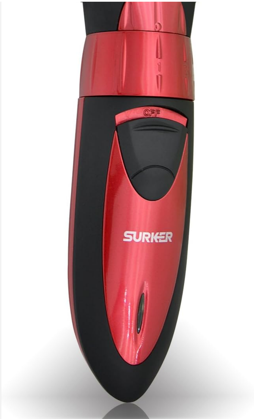
Figure 2.1: Front view of the SURKER HC-7068 Hair Clipper, showcasing its red and black design with the SURKER logo.