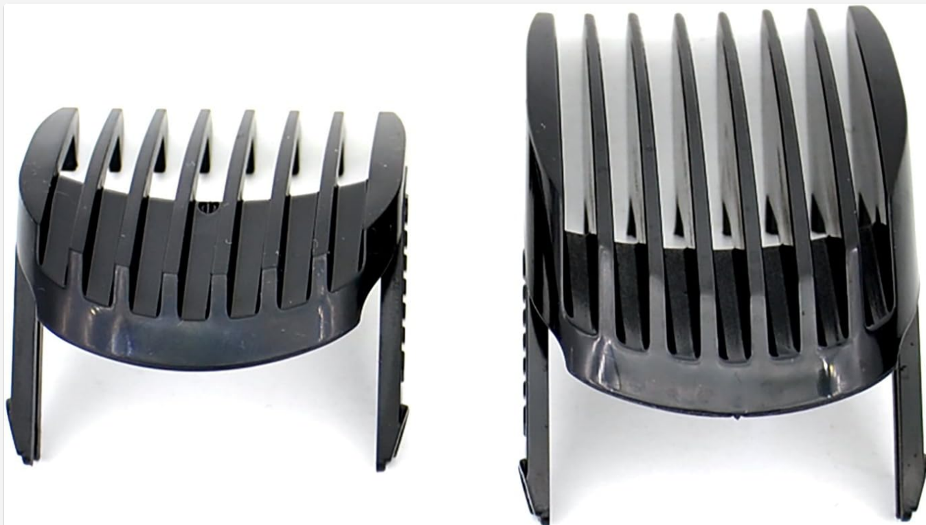
Figure 2.3: Included guide comb attachments for varying cutting lengths.