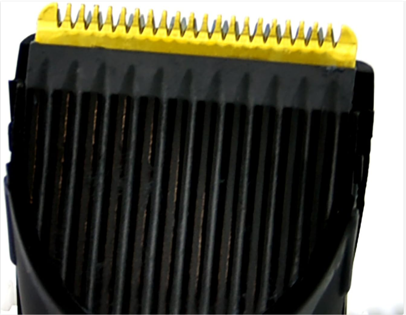
Figure 2.4: Close-up view of the precision metal blade.