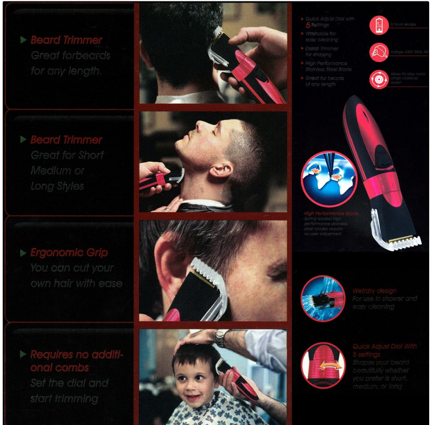
Figure 4.1: Illustrative examples of the clipper's versatility for different grooming needs and its ergonomic design.