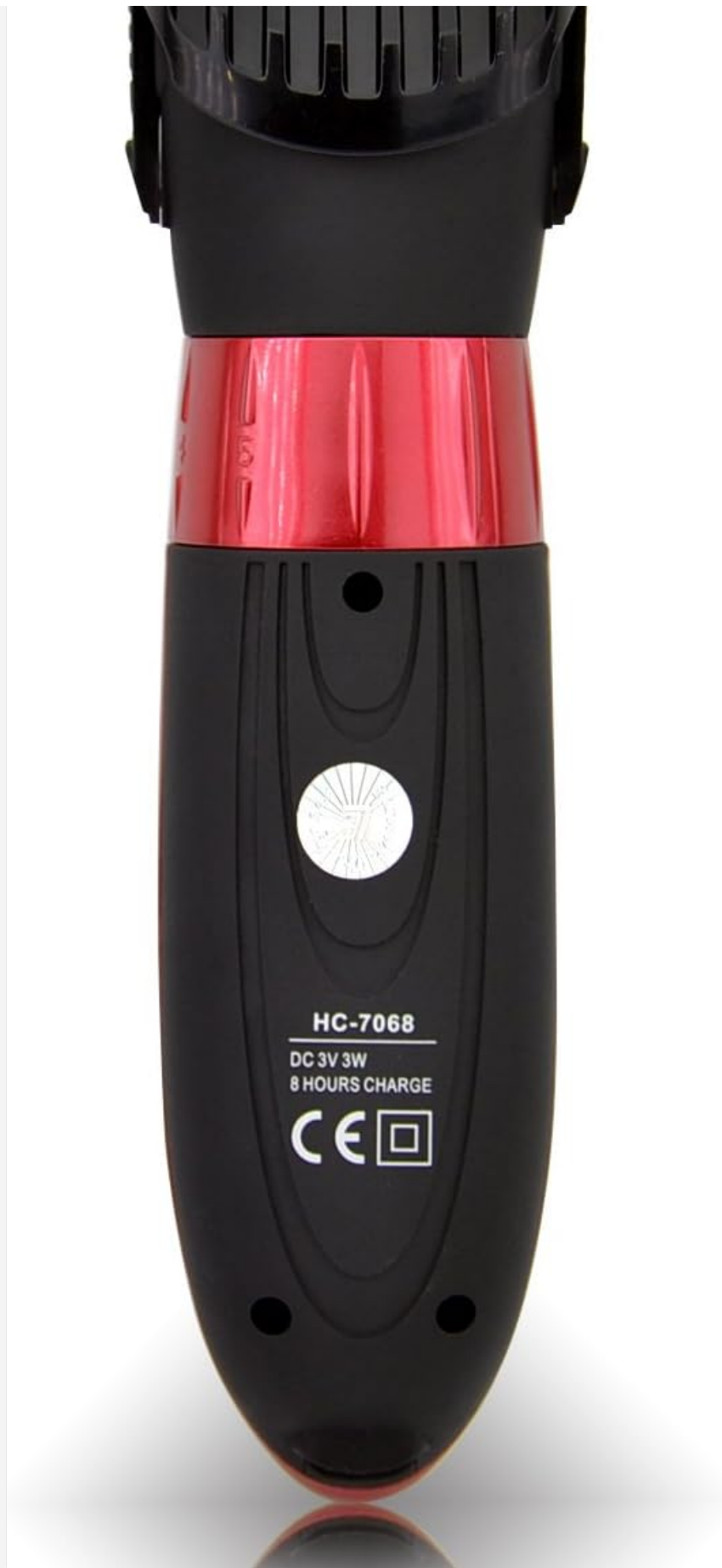
Figure 2.2: Back view of the hair clipper, displaying the model number HC-7068 and charging specifications.