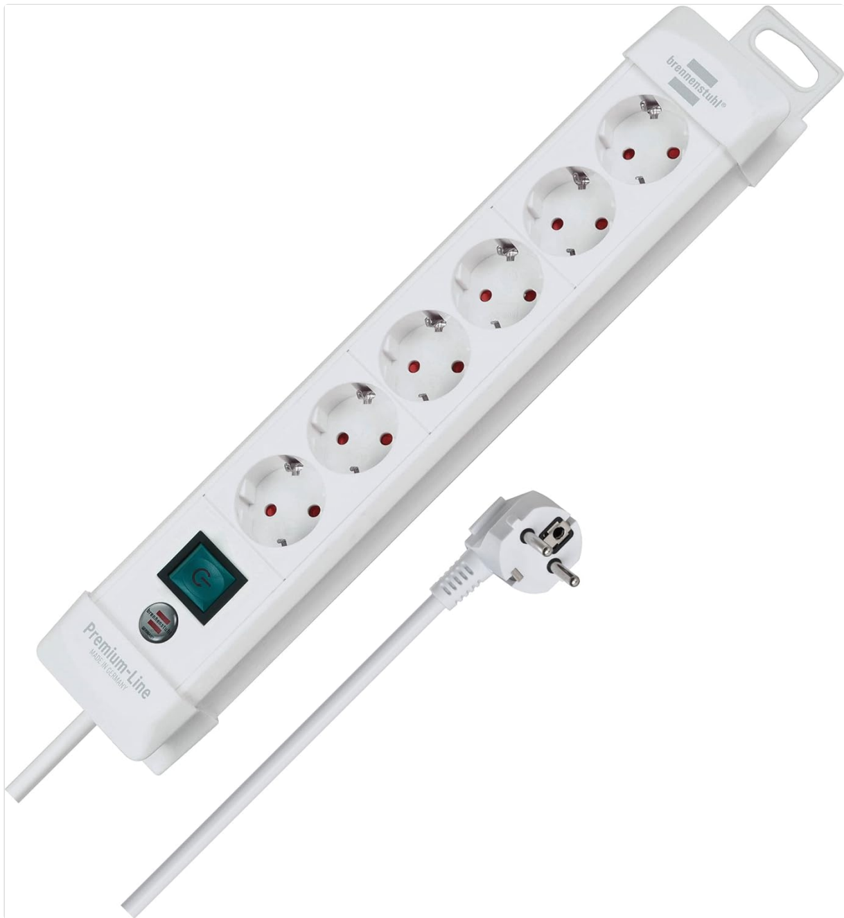
Figure 1: Overall view of the Brennenstuhl Premium-Line 6-Way Power Strip, showing the six sockets, illuminated switch, and attached 3-meter power cable.