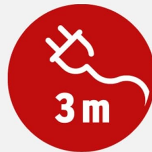
Figure 3: Close-up illustrating the highly break-resistant special plastic construction, the illuminated 2-pole safety switch, and the specifications of the 3-meter H05VV-F 3G1.5 cable.

Mit 3m Kabellänge H05VV-F 3G1.5 With 3m cable length H05VV-F 3G1.5