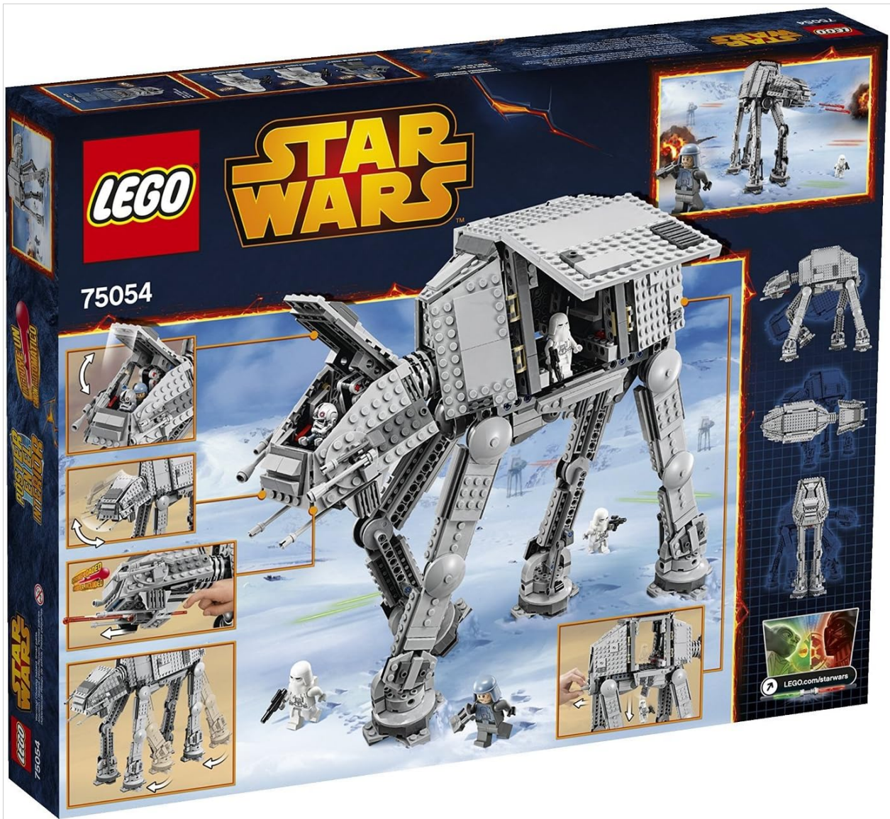
Figure 2.2: Back view of the LEGO Star Wars AT-AT Building Set (75054) packaging, illustrating various features and play functions of the model.

Your browser does not support the video tag.