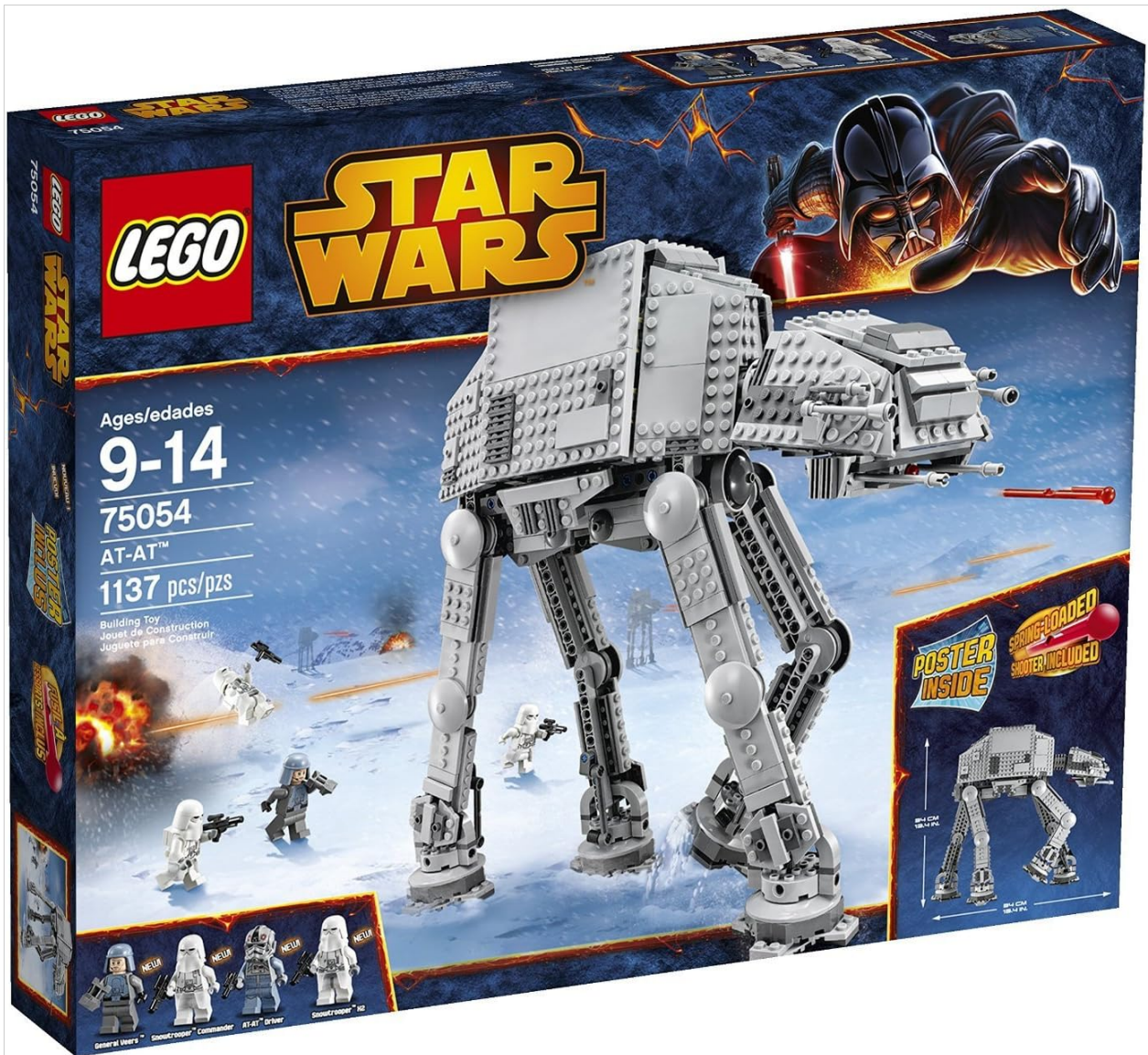
Figure 2.1: Front view of the LEGO Star Wars AT-AT Building Set (75054) packaging, showing the assembled model and minifigures.