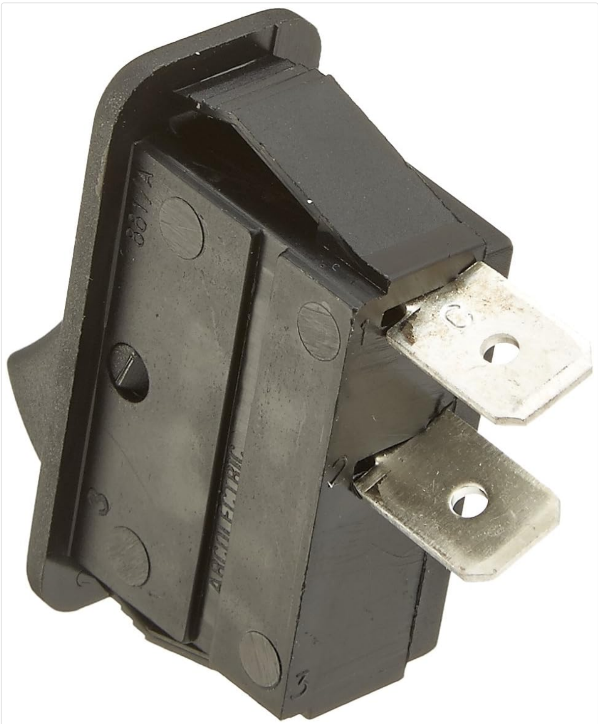
Figure 1: Raypak 009493F Rocker Switch. This image shows the black rocker switch with two metal terminals for electrical connection.

This kit includes one black plastic rocker switch, designed for durability and reliable operation in its intended environment. Its compact dimensions (approximately 1 x 1 x 1 inches) ensure compatibility with existing heater enclosures.