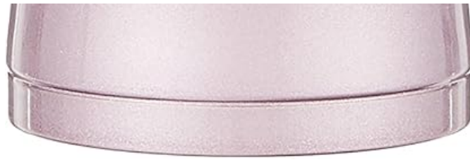
Lid Mechanism: A close-up of the flip-lid, highlighting the safety lock mechanism for secure closure.