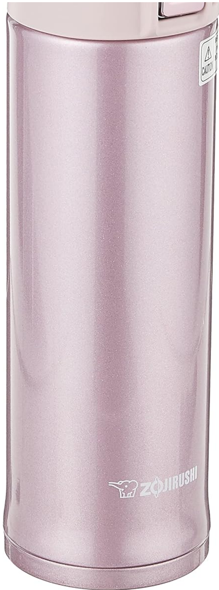
Overall View: The Zojirushi Stainless Mug in Lavender, showcasing its sleek design and flip-lid.