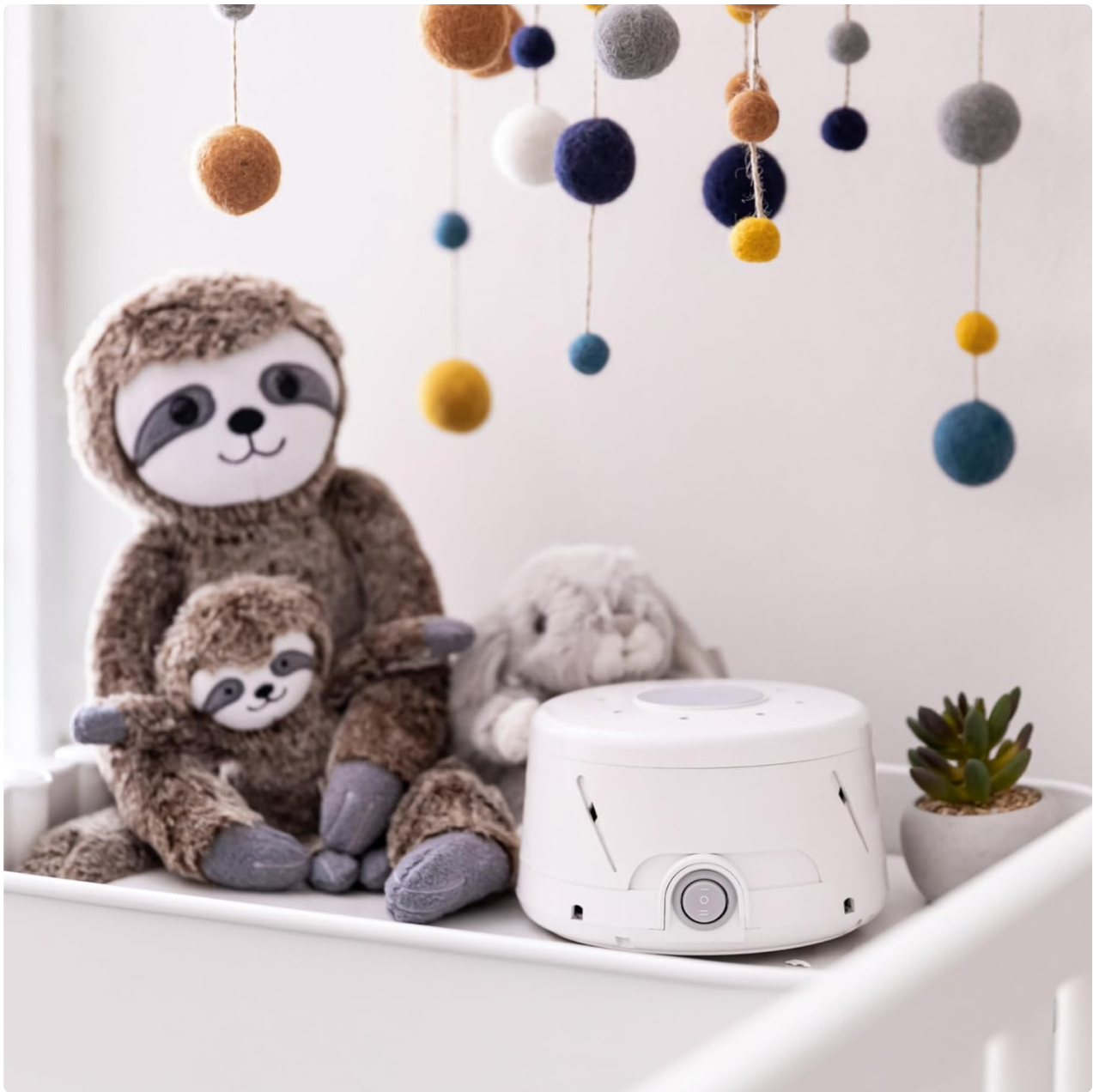
The Dohm Classic is a perfect addition to a nursery, providing soothing sounds for infants.