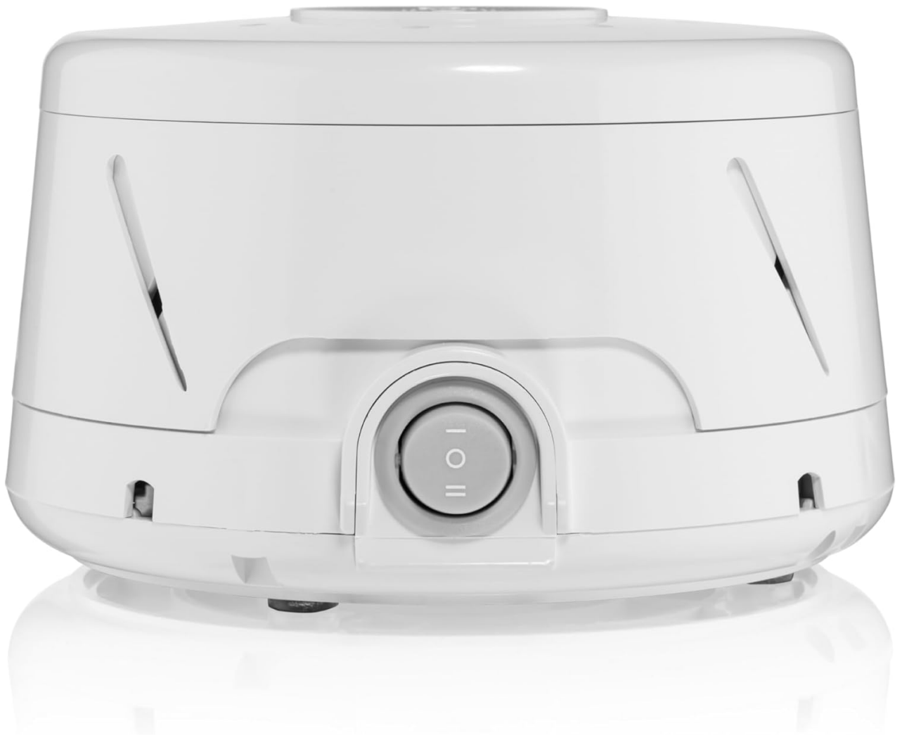
The Yogasleep Dohm Classic White Noise Sound Machine, showcasing its simple and functional design.