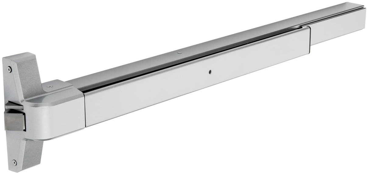
Figure 1: Overall view of the Dynasty Hardware Push Bar Panic Exit Device.