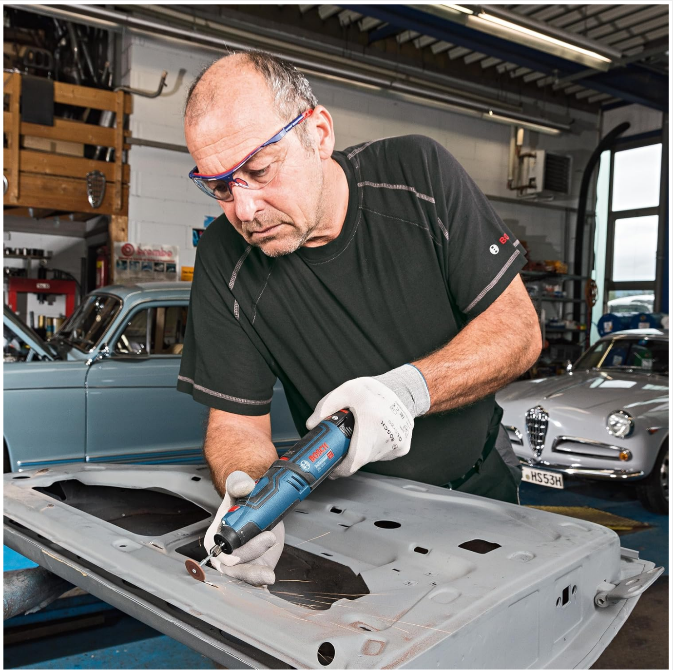
Figure 4.1: Using the rotary tool with a cutting disc for metal work. Ensure proper ventilation and wear eye protection.