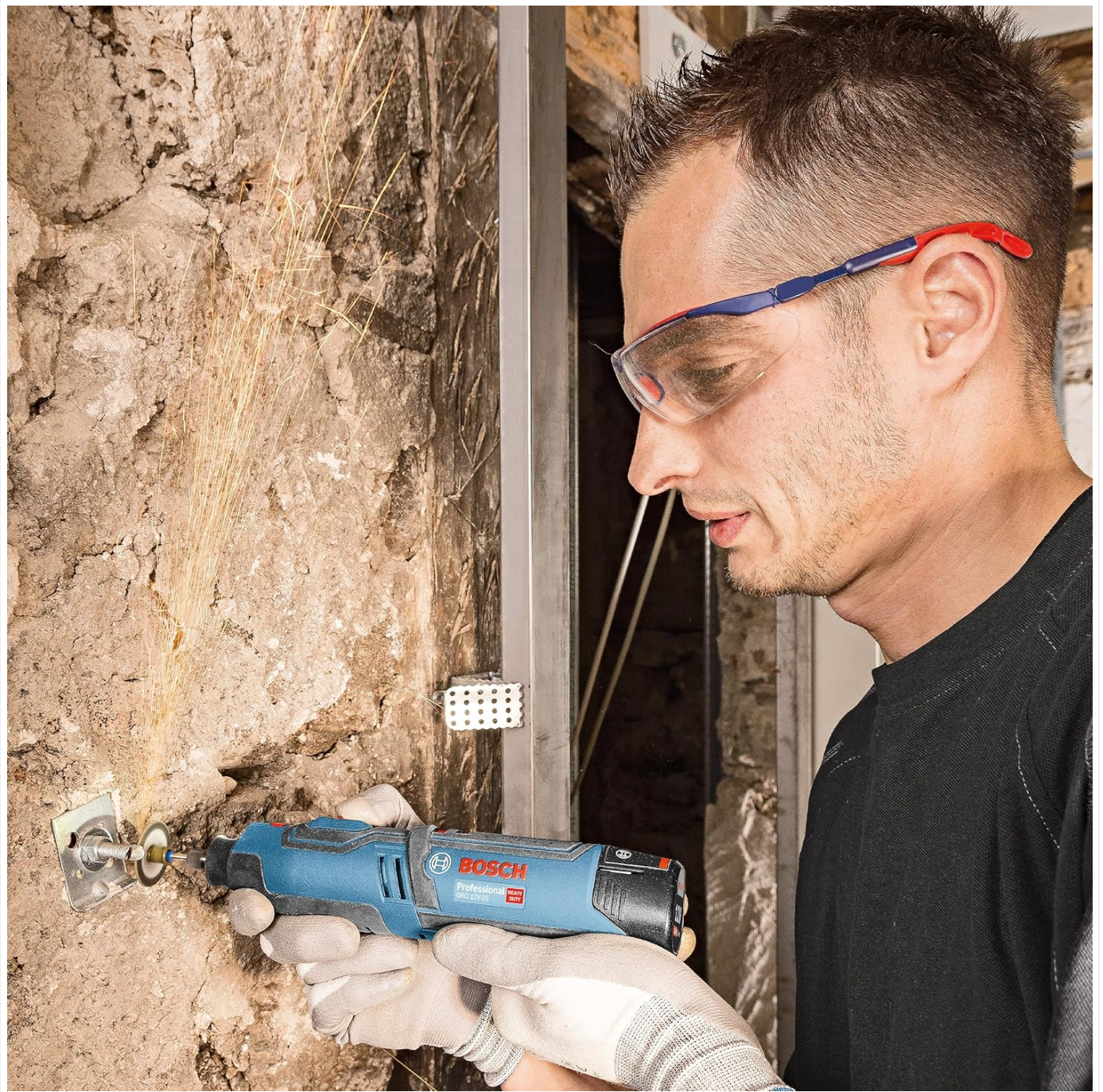
Figure 4.3: Grinding a metal fixture embedded in a wall. Sparks are generated, requiring appropriate safety measures.