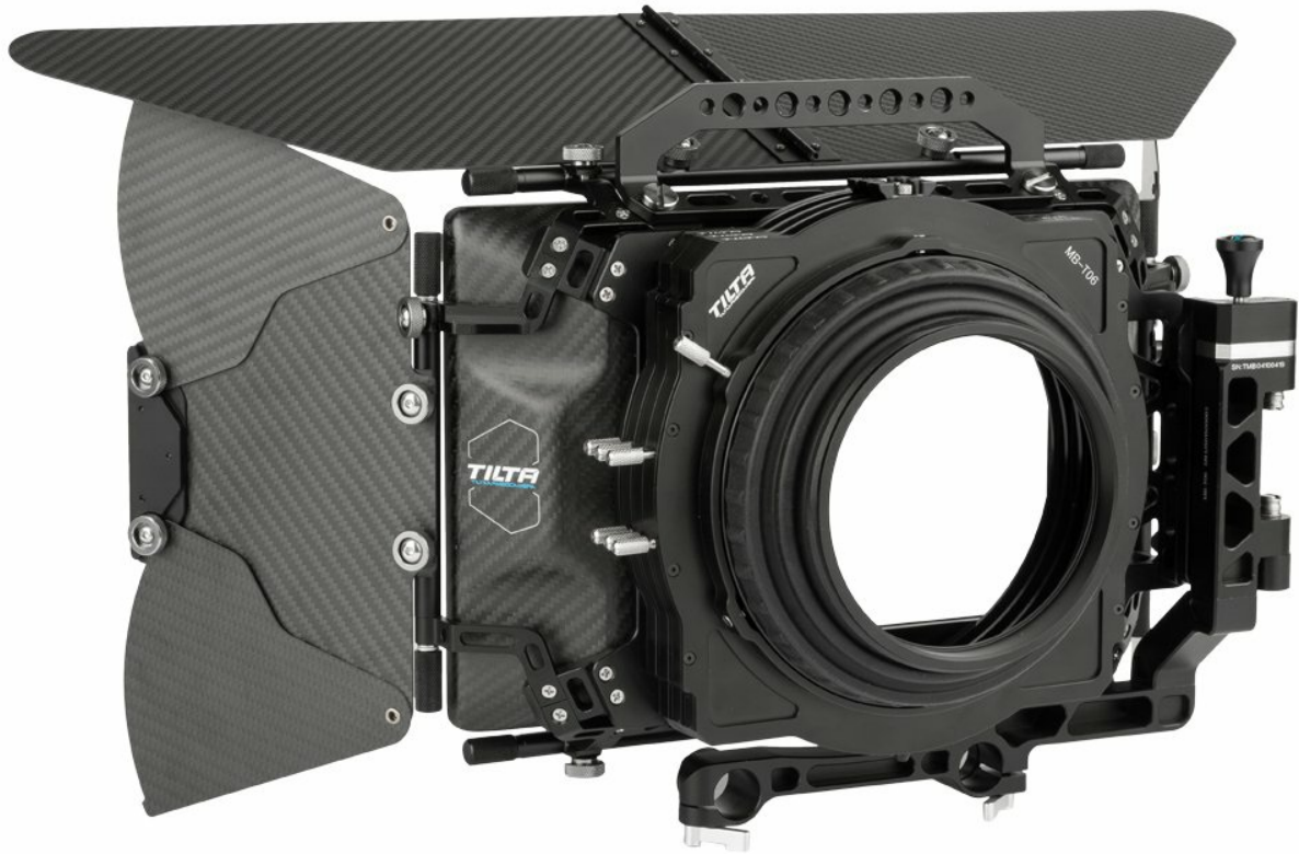
Image: The Ikan MB-T06 Tilta 6x6 Carbon Fiber Matte Box shown with its top and side flags open, providing a clear view of the filter stages and lens opening.