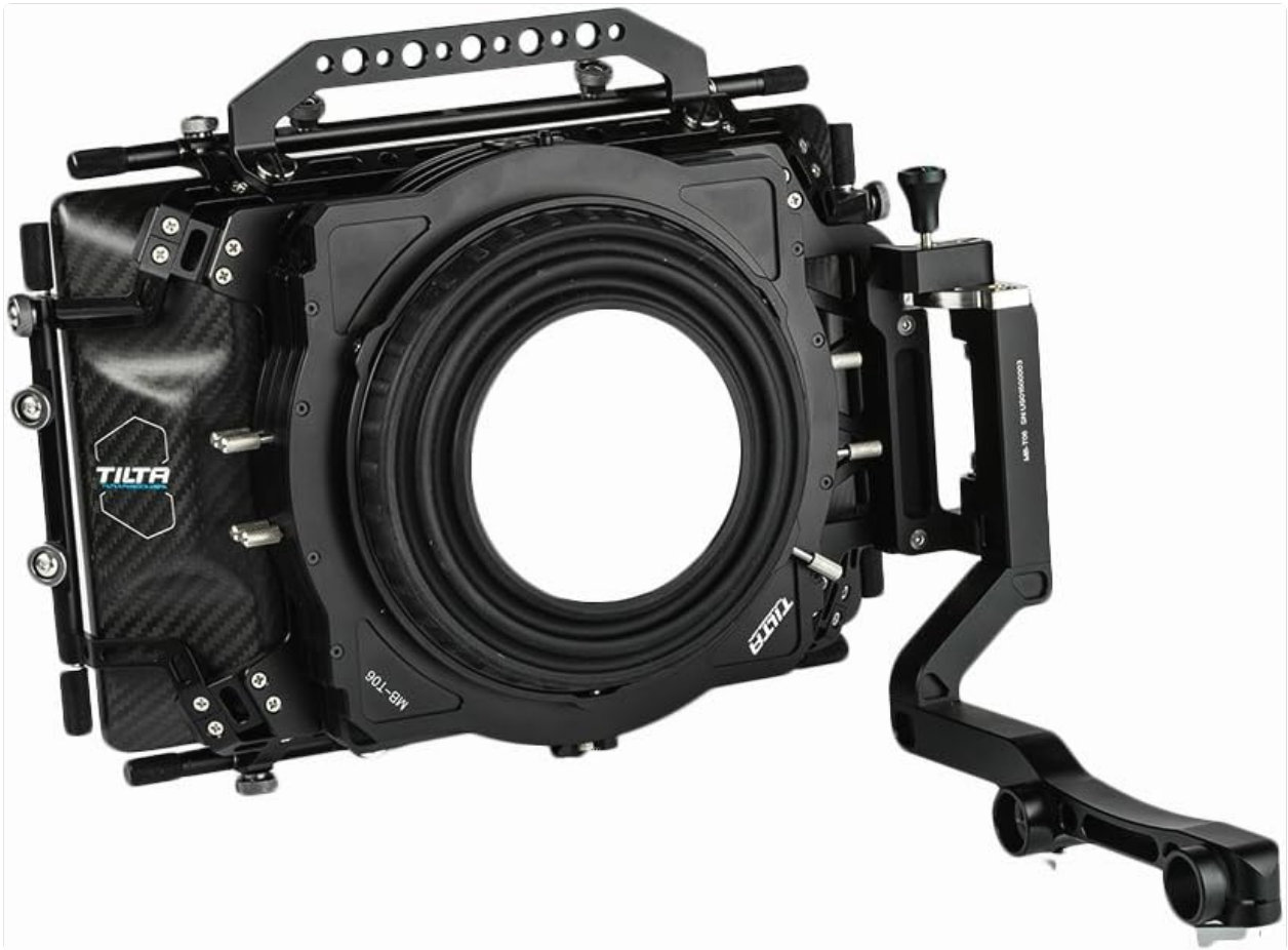
Image: The Ikan MB-T06 matte box securely mounted on a camera rig, demonstrating its integration with the rod system.