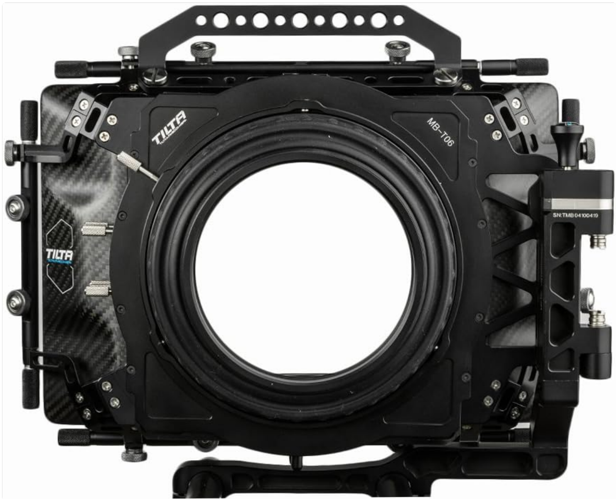
Image: The Ikan MB-T06 matte box shown with a 35-40mm matte insert installed, demonstrating how different inserts fit into the front of the unit.