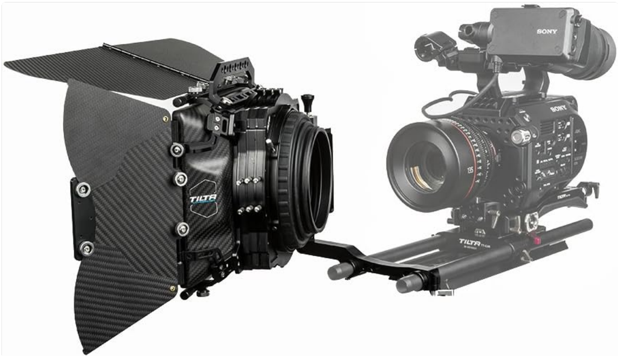
Image: All components of the Ikan MB-T06 Tilta 6x6 Carbon Fiber Matte Box kit laid out, including the matte box, flags, rod adapters, matte inserts, and adapter rings.

The Ikan MB-T06 Tilta 6x6 Carbon Fiber Matte Box package includes the main matte box unit, a carbon fiber French flag, two carbon fiber side wings, a 19mm rod adapter, a 15mm rod adapter, and various matte inserts (16-20mm, 24-28mm, 35-40mm, 50-65mm, 85-180mm) and adapter rings (134mm, 114mm, 95mm, 80mm) to accommodate different lens sizes.