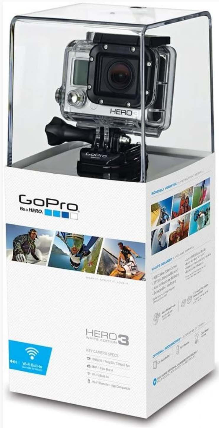
Figure 1: GoPro HERO3 White Edition in retail packaging.