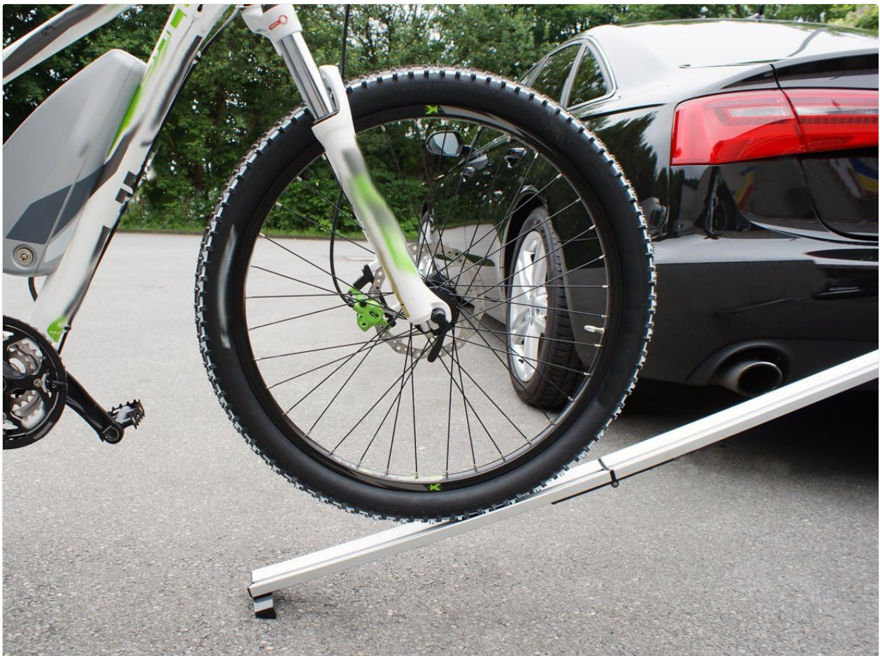
Figure 5.2: A close-up view of a bicycle wheel properly positioned on the EUFAB loading ramp, illustrating the correct