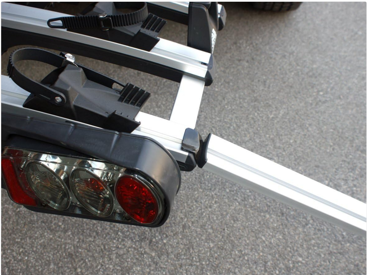
Figure 4.2: A close-up view illustrating how the loading ramp securely connects to the bike carrier, ensuring stability during use.