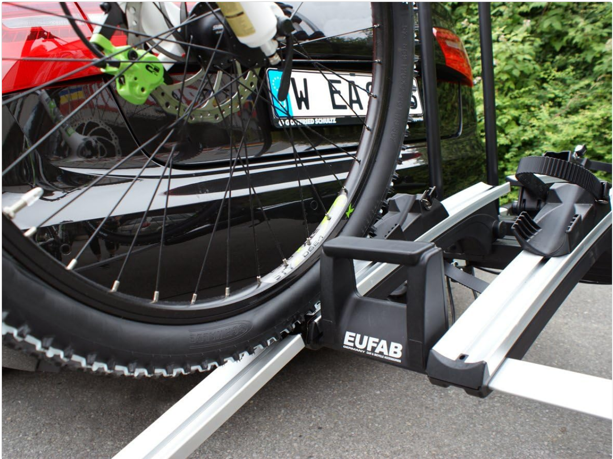
Figure 5.3: A bicycle wheel resting on the bike carrier, with the EUFAB loading ramp still attached, illustrating the successful transition of the bike onto the carrier.

alignment for rolling the bike onto the carrier.