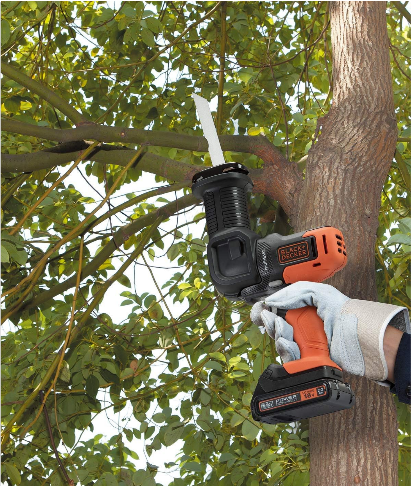
Image 5.1: The ERS183 Multi-Saw Head being used for pruning a tree branch. The saw's design allows for effective cutting in various orientations.