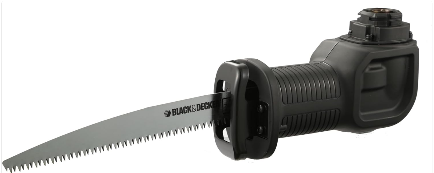
Image 1.1: The BLACK+DECKER Multi-Saw Head ERS183 with a blade installed.

This head is ideal for tasks such as dismantling bulky waste, pruning garden trees, and general cutting applications in woodworking and metalworking.