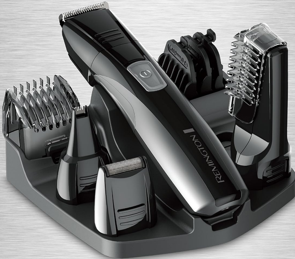
Figure 8: Washable attachments, designed for easy rinsing under a faucet.

Body Hair Trimmer, Full-Size Trimmer, Foil Shaver, Detail Trimmer, 3 Beard & Stubble Combs, Adjustable Haircut Comb & Storage Stand