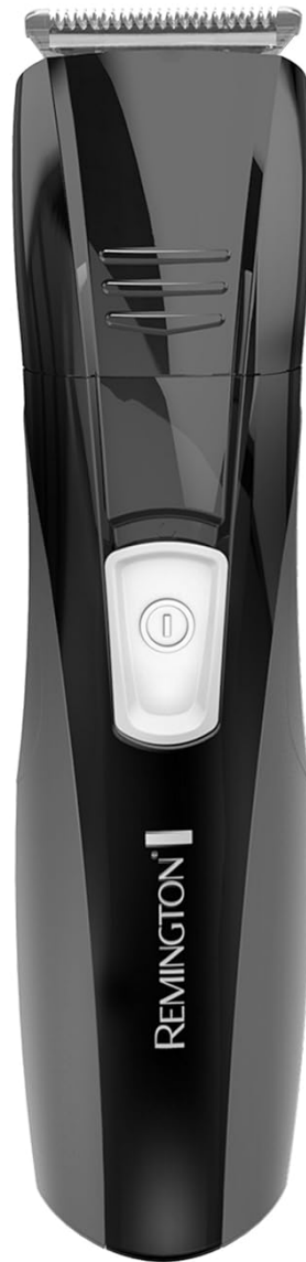
Figure 9: Product dimensions for the Remington groomer.