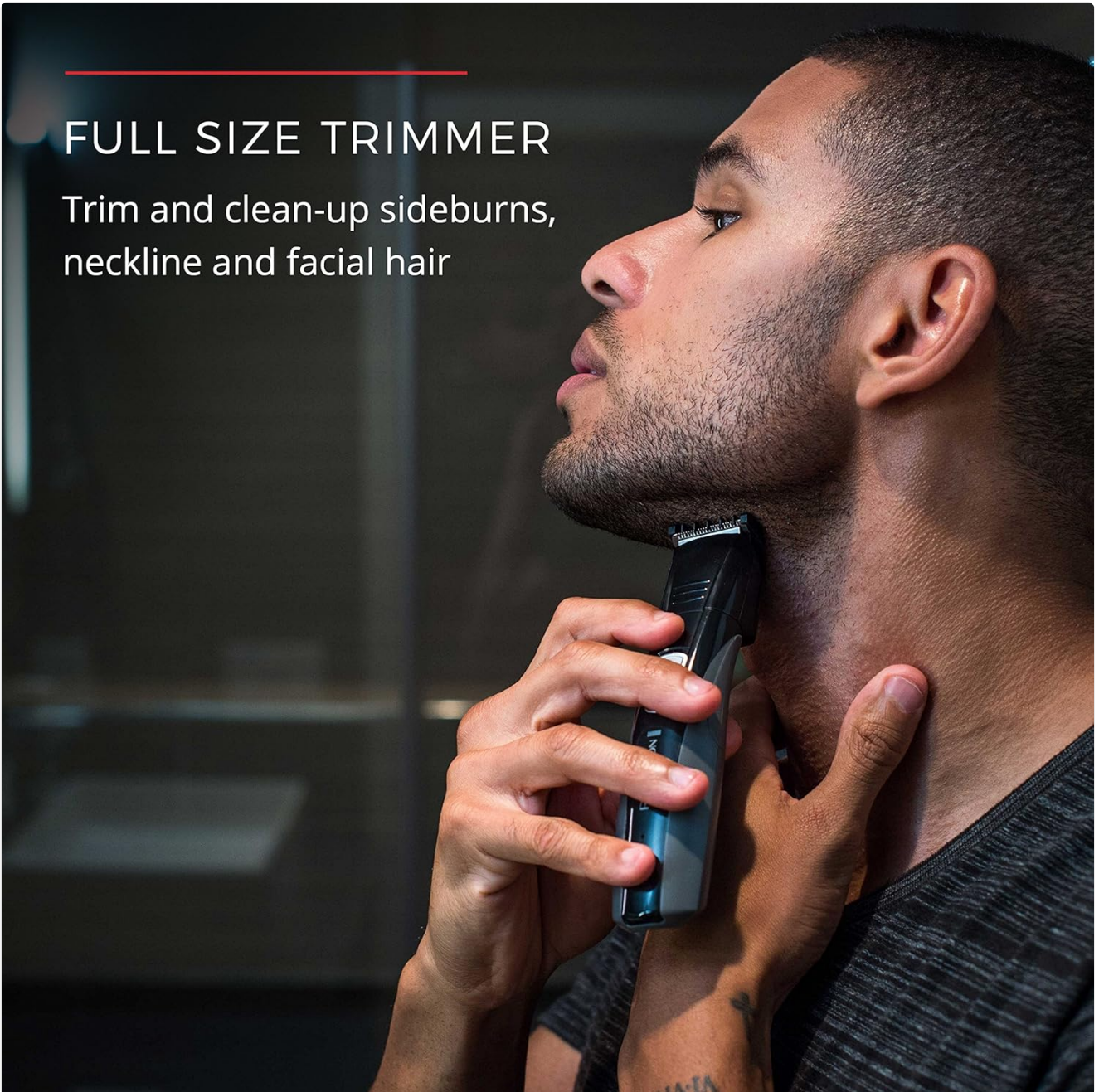
Figure 3: The full-size trimmer in use for beard and neckline grooming.

Trim and clean-up sideburns, neckline and facial hair