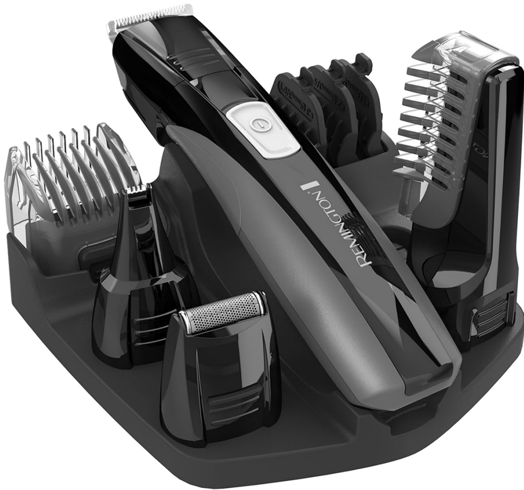
Figure 1: The Remington Head to Toe Groomer Kit, showcasing the main unit, various attachments, and the charging stand.