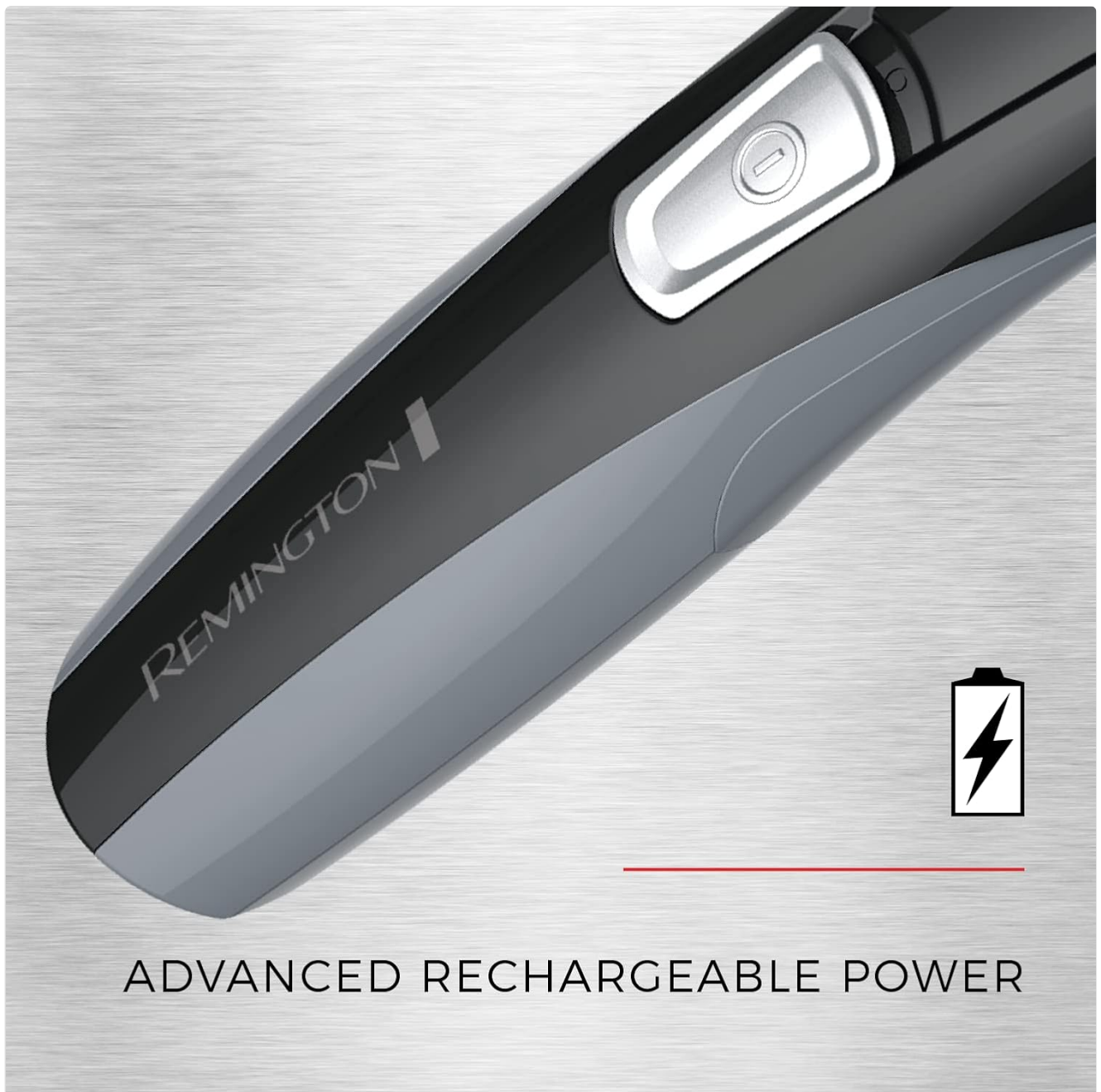
Figure 2: The groomer's handle, highlighting its advanced rechargeable power capability.