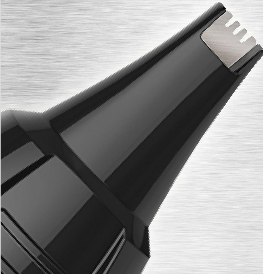
Figure 4: The body hair trimmer being used for comfortable body grooming.