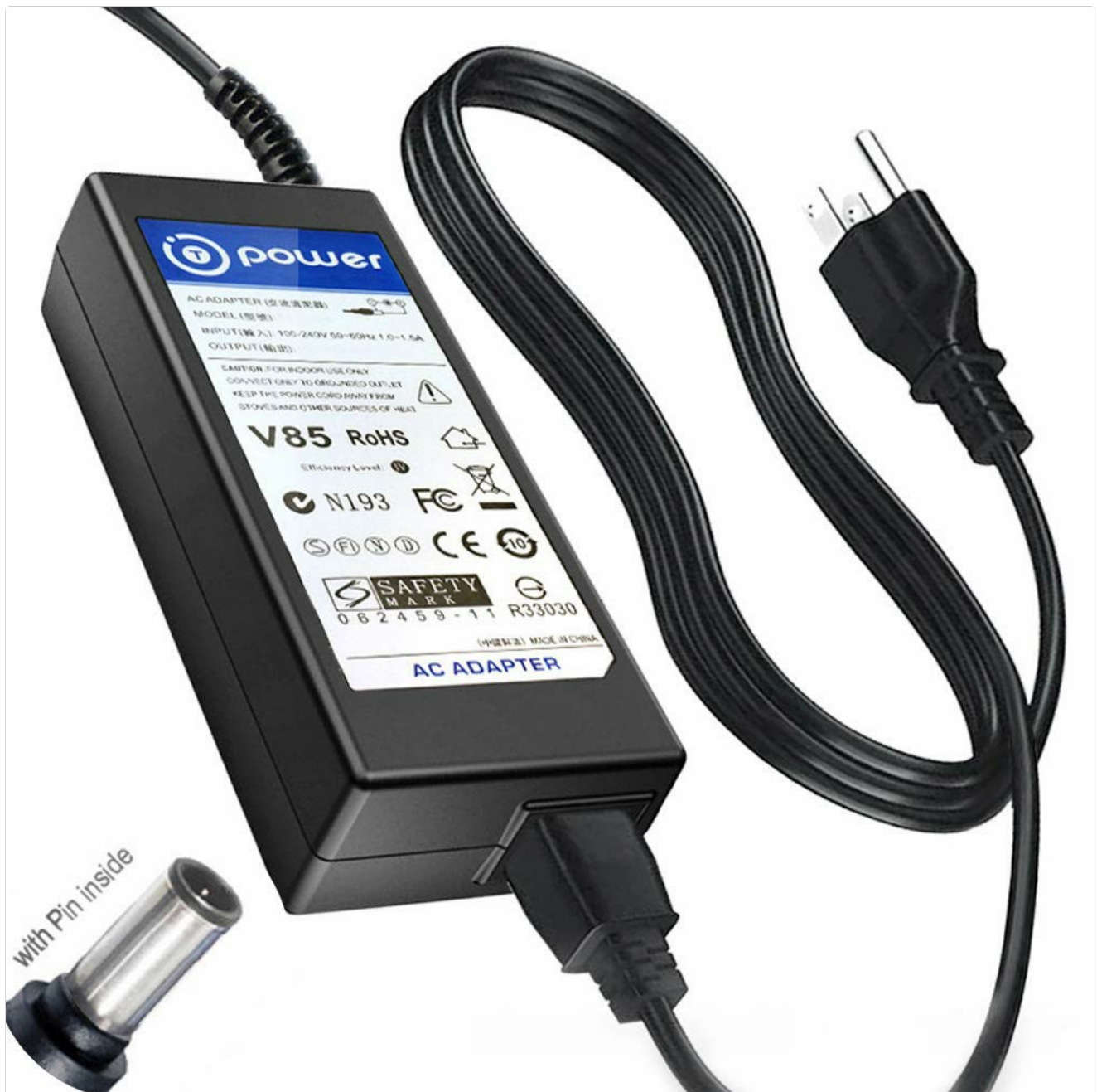
Image: T POWER 24V AC DC Adapter with power cord.