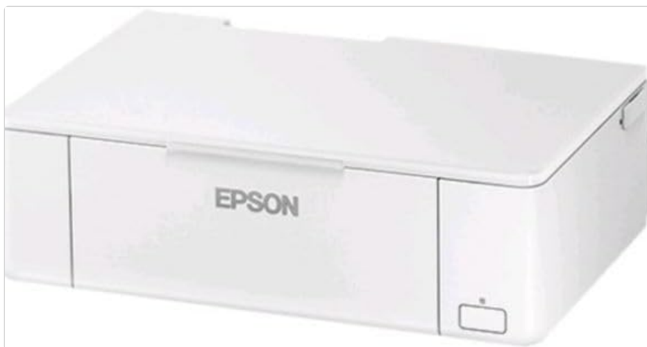
Image: Epson PictureMate PM-400 Wireless Compact Color Photo Printer, a compatible device.