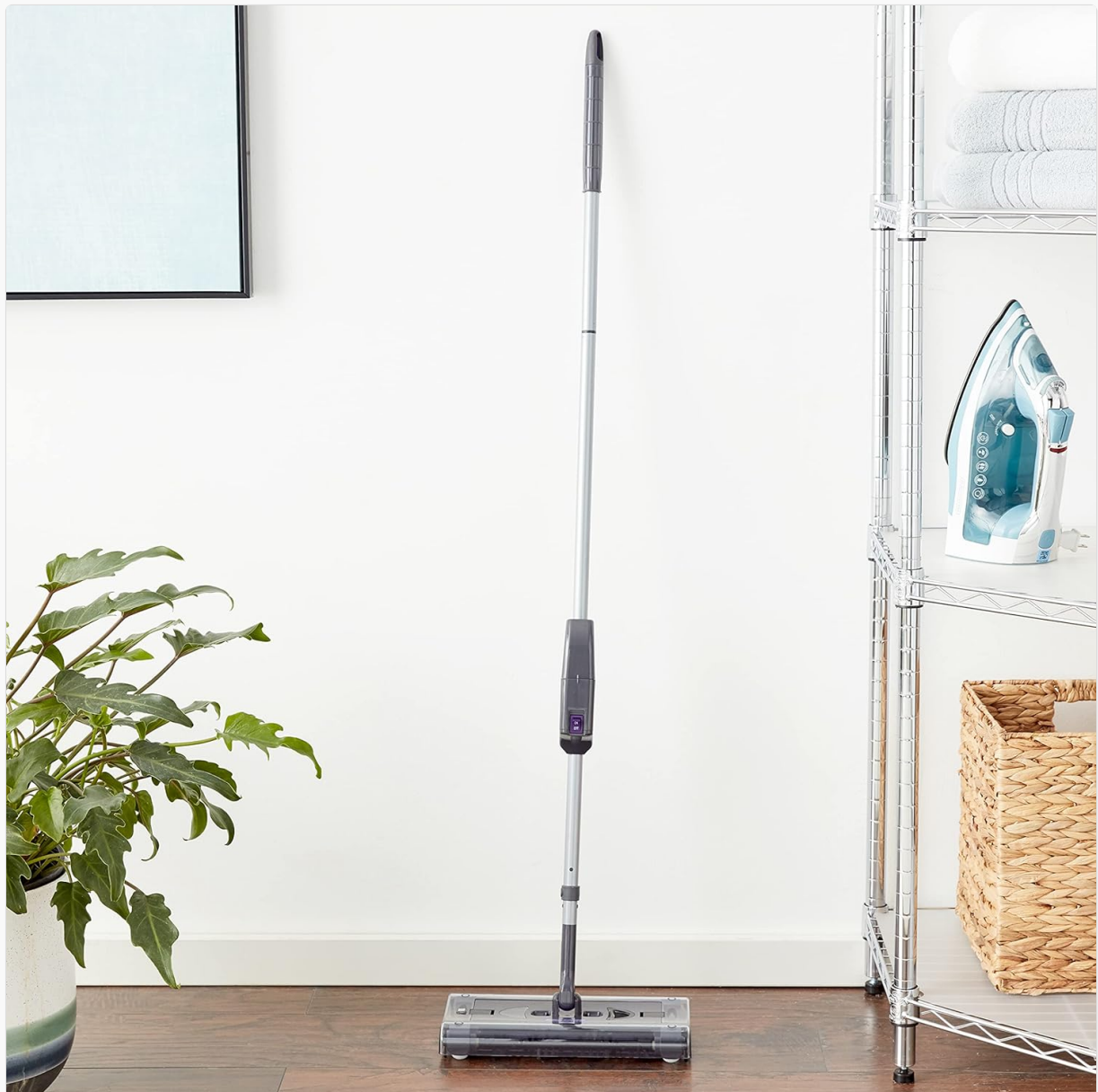
The Swivel Sweeper Max can be stored upright.

3. Storage: When not in use, the sweeper can be stored upright. The handle may have a magnetic feature to hold it in a vertical position against a wall.