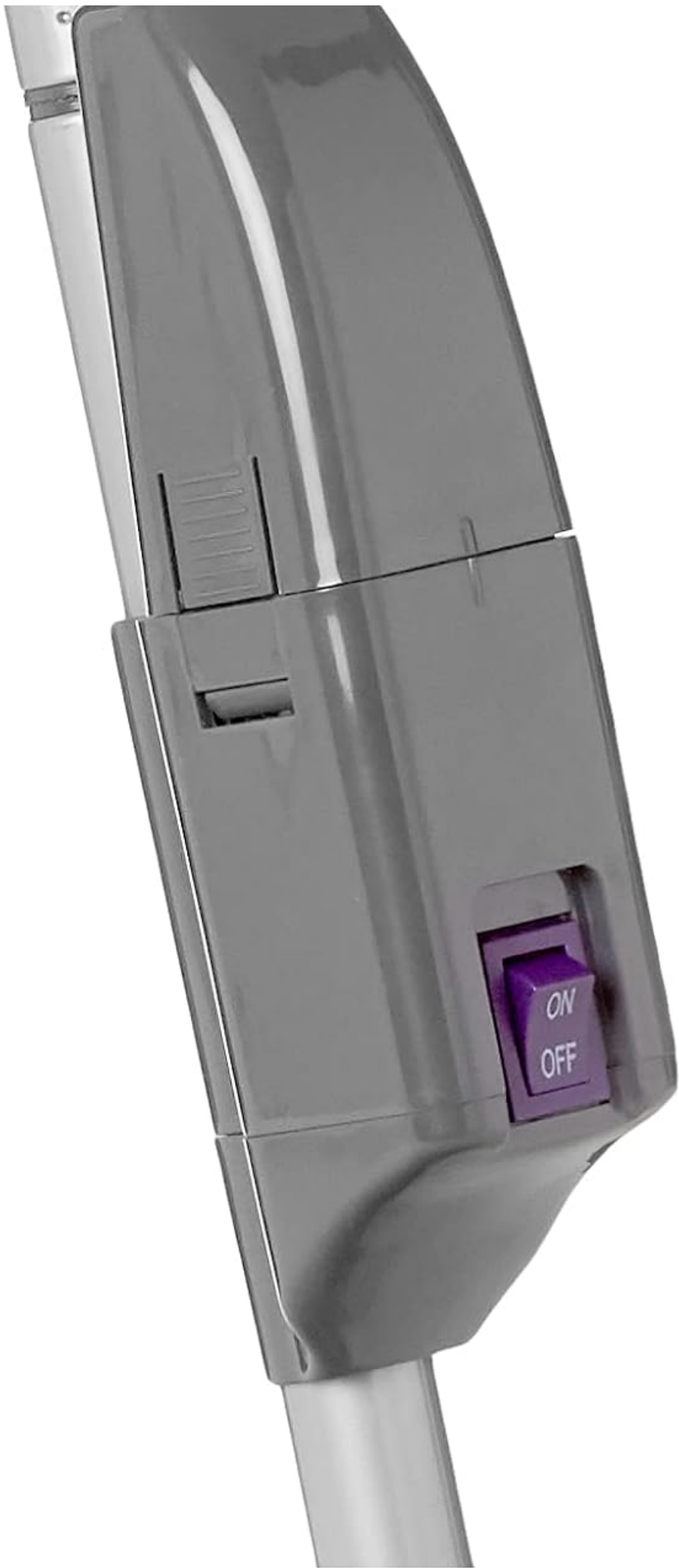
The power switch located on the handle of the Swivel Sweeper Max.