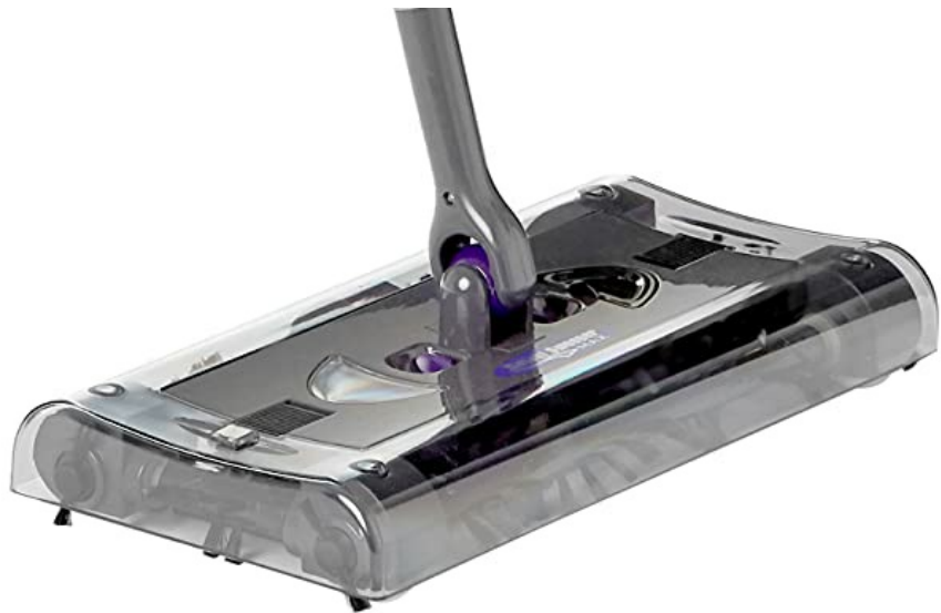
The Ontel Swivel Sweeper Max, a lightweight cordless electric sweeper.