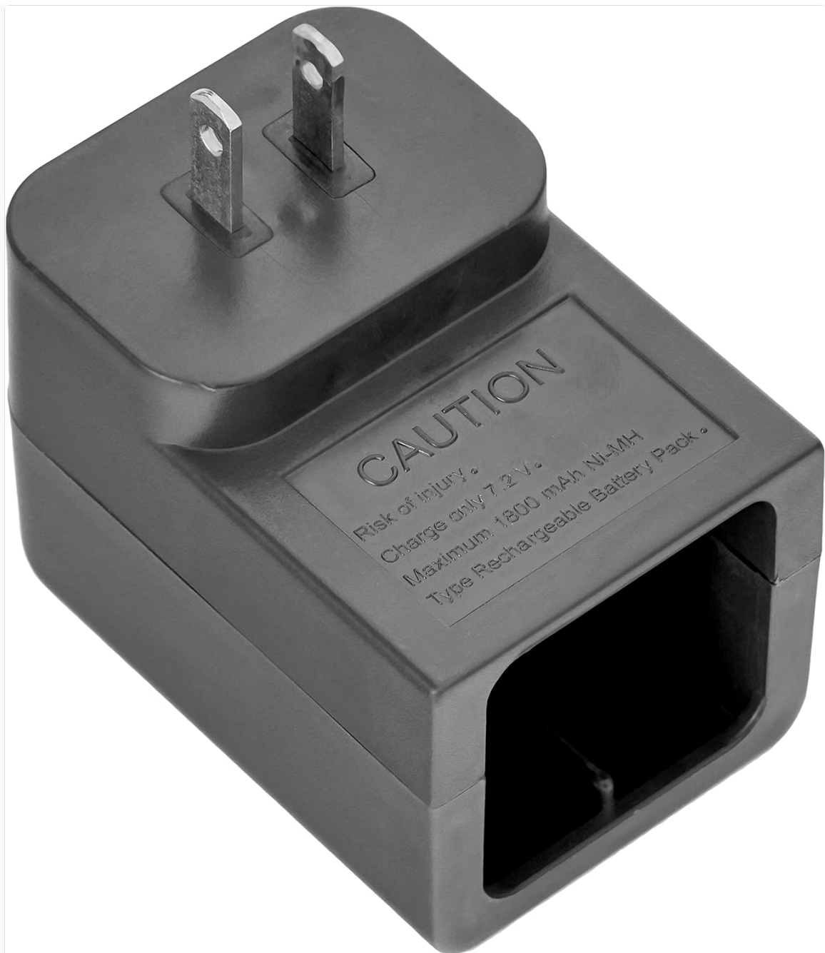
The battery charger for the Swivel Sweeper Max.