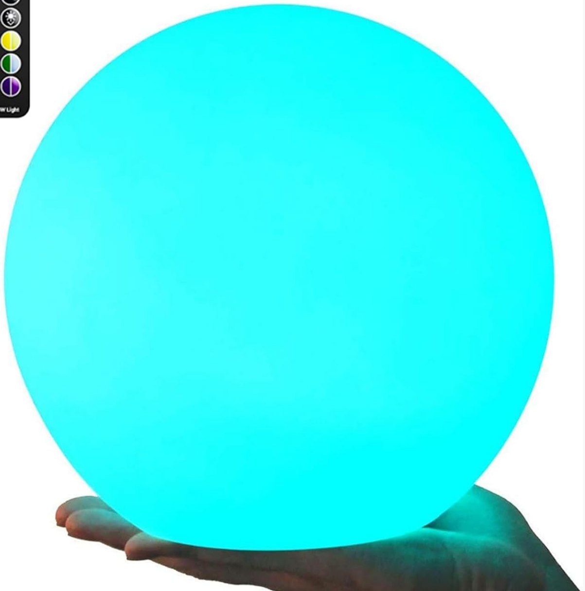
Image 4.1: The LOFTEK 8-inch LED Night Light Ball with its remote control.