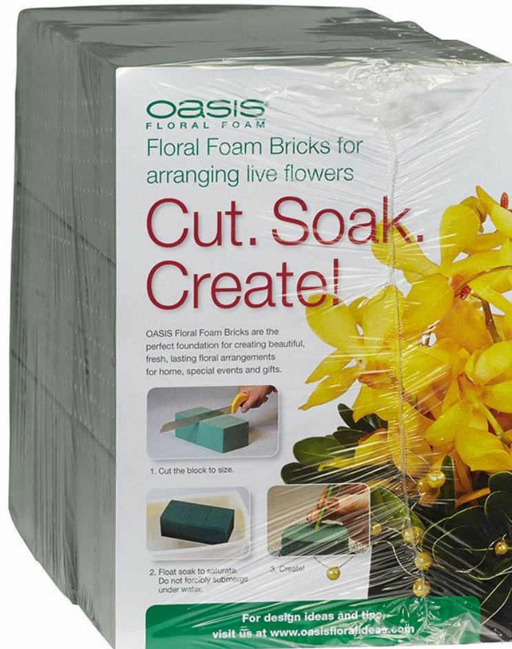
Image: A pack of Oasis Standard Floral Foam Bricks, showing their typical green color and rectangular shape. These bricks are designed to be cut and hydrated for floral arrangements.