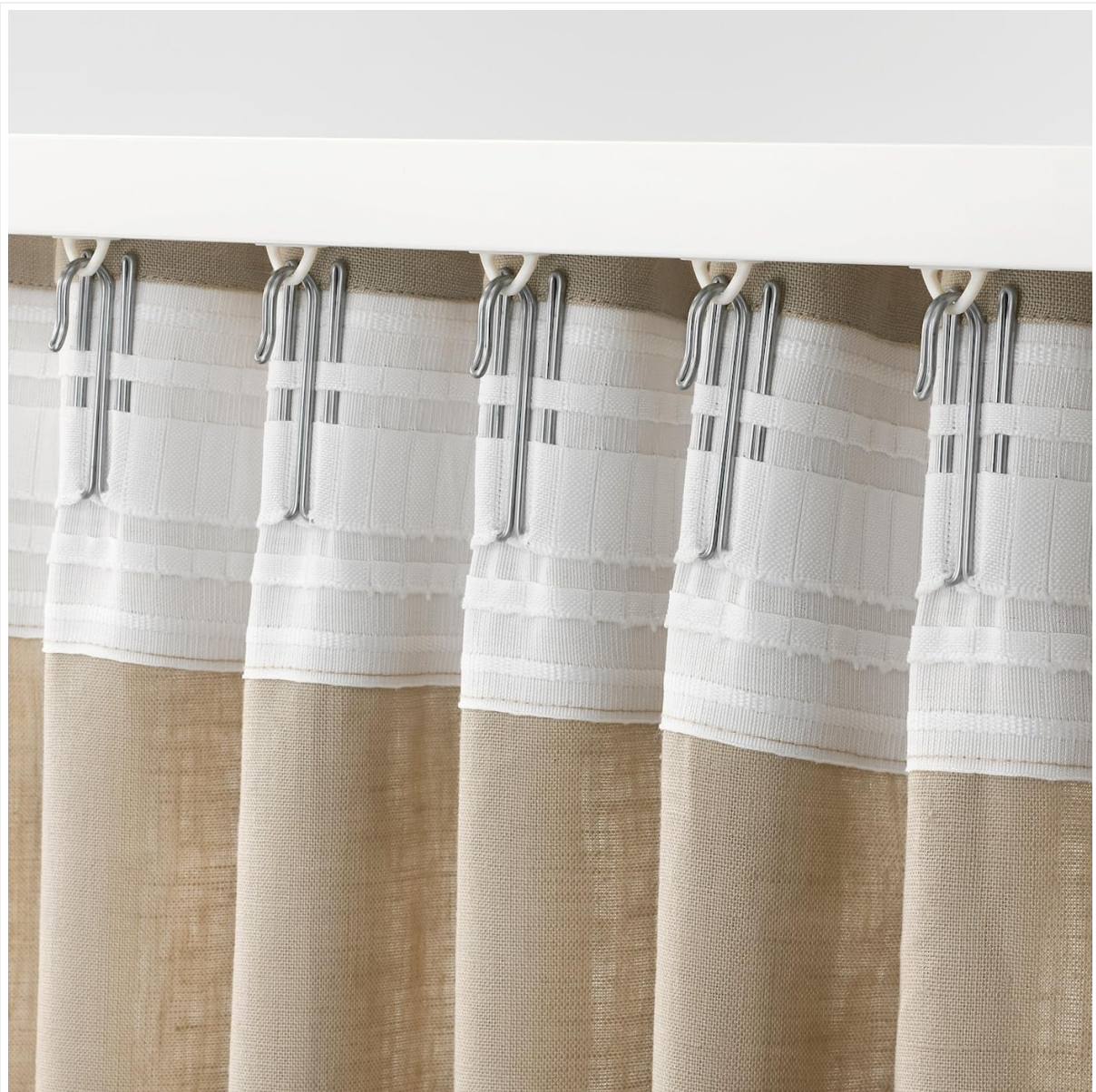
Image 2: A detailed view of IKEA RIKTIG hooks correctly installed on a curtain's heading tape and suspended from a curtain track. The image demonstrates how the hooks secure the curtain for hanging.