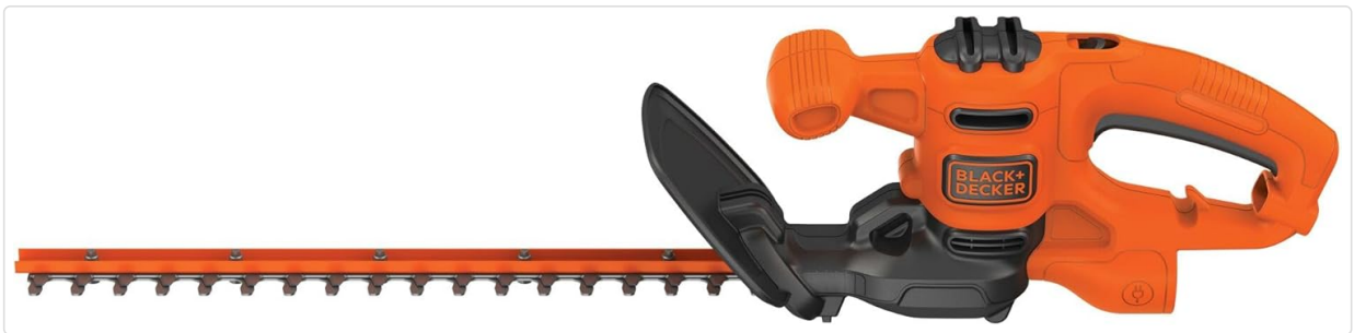
Figure 1: The BLACK+DECKER BEHT150 Electric Hedge Trimmer. Always prioritize safety when operating power tools.