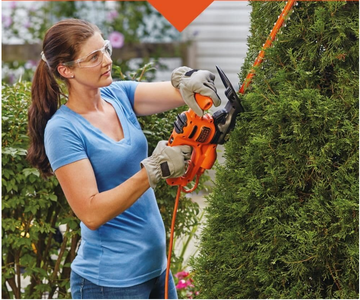
Figure 5: The lightweight design allows for easier vertical trimming of taller shrubs.