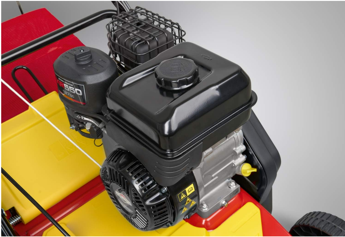
Image 3.1: Close-up view of the Briggs & Stratton 550 series engine on the scarifier, showing the fuel cap and oil fill points.