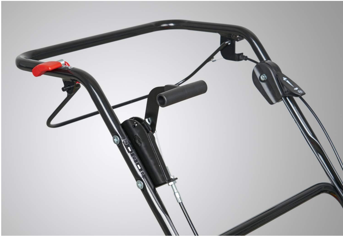
Image 4.1: Detail of the scarifier's handle, showing the safety bail lever and engine control levers for starting and stopping the unit.