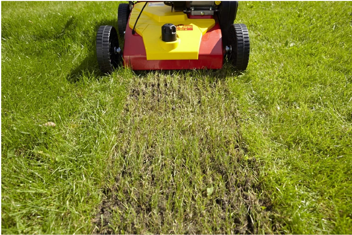
Image 4.2: The scarifier in operation, demonstrating its effectiveness in removing thatch and debris from a lawn, leaving distinct lines.