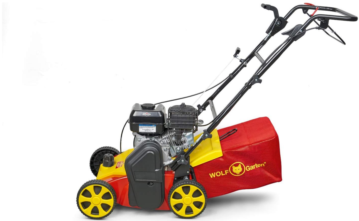
Image 1.1: Side view of the WOLF Garten 16AHGJ0F650 VA 357 B Burst Scarifier, showcasing its red and yellow design with the engine and collection bag visible.

This manual provides essential information for the safe and effective operation, maintenance, and care of your WOLF Garten 16AHGJ0F650 VA 357 B Burst Scarifier. This petrol-powered garden tool is designed for 3-in-1 functionality: aerating, scarifying, and collecting lawn debris. It features a B&S 550 series engine, 6-position central depth adjustment, and a 45-liter collection bag. Please read this manual thoroughly before initial use and keep it for future reference.