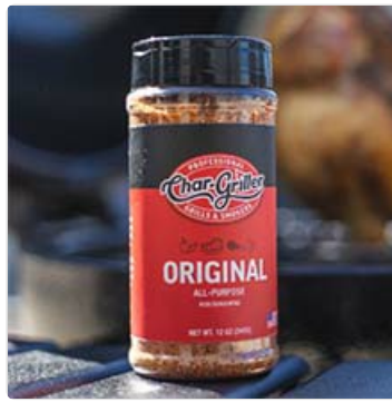
Figure 12: Recommended seasoning for grill maintenance.