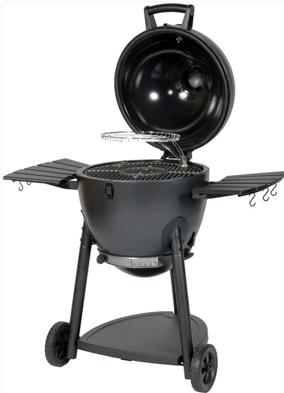
Figure 10: The Easy Dump Ash Pan for quick and clean ash removal.