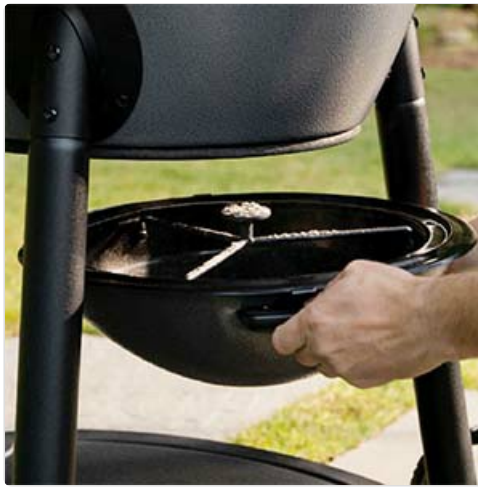
Figure 8: Installing a heat deflector for indirect cooking.