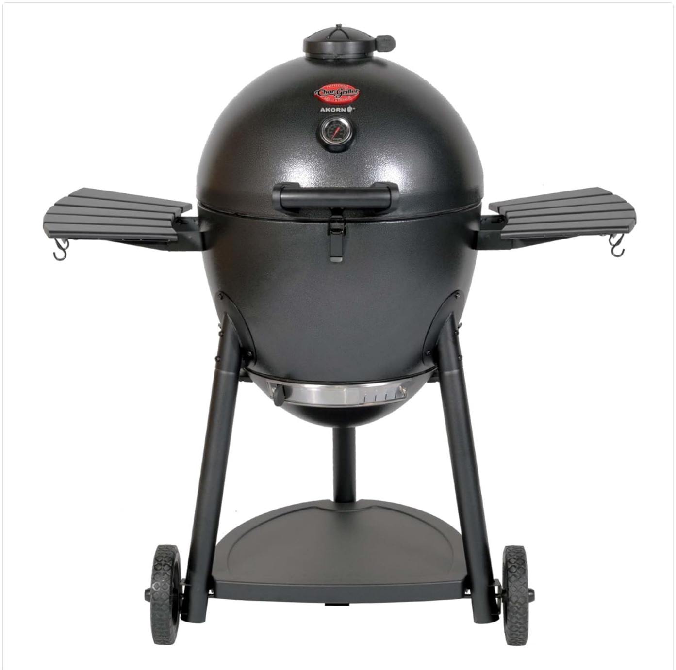
Figure 1: Front view of the Char-Griller AKORN Kamado Charcoal Grill and Smoker.