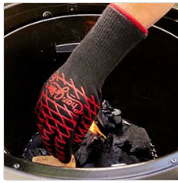
Figure 2: Placing charcoal for initial setup.