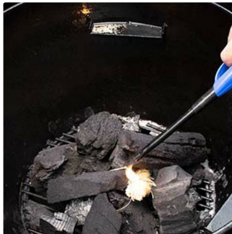
Figure 3: Igniting charcoal in the grill.

Place your preferred charcoal (lump charcoal or briquettes) on the charcoal grate. Use a charcoal starter or natural fire starters to ignite the charcoal. Avoid using lighter fluid as it can impart an undesirable flavor to your food.