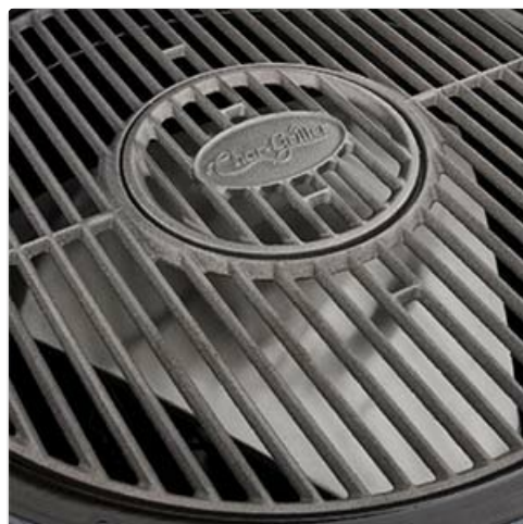
Figure 6: Adjusting the top damper to control airflow.