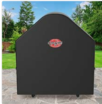
Figure 13: Grill covered for protection against elements.

The metal body of the grill is prone to rust if not properly cared for, especially in humid environments. It is highly recommended to keep the grill covered when not in use, even if stored indoors. Periodically oil exposed metal parts to prevent rust. If the grill gets dirty, you can open both the lower and top vents to burn off residue, then brush off the dust once cooled.