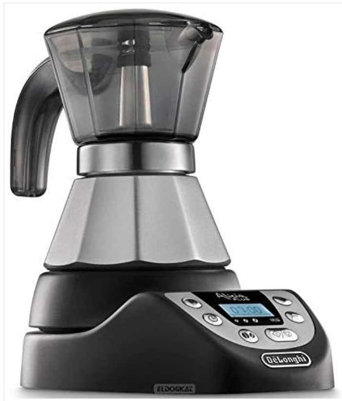
Figure 2: Side view of the coffee maker, highlighting the handle and the detachable base.