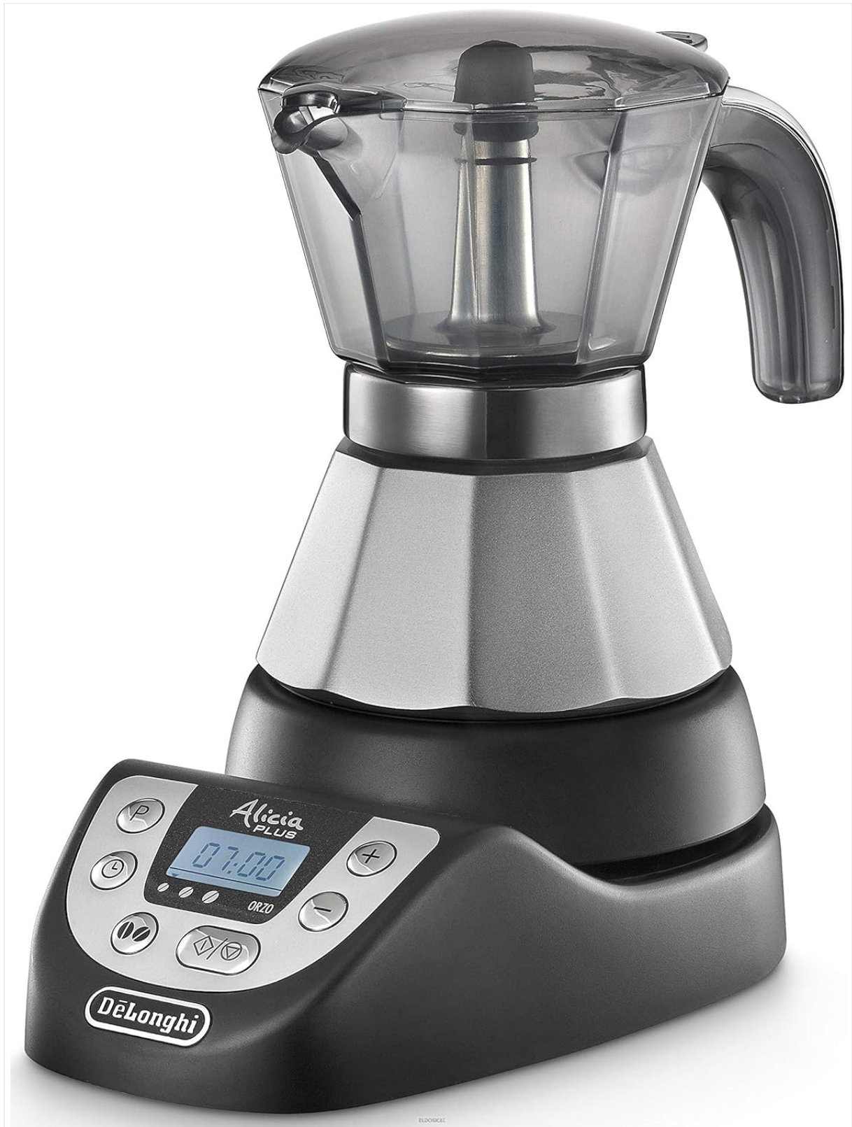
Figure 1: Front view of the De'Longhi Alicia PLUS EMKP 21.B Electric Moka Coffee Maker. Shows the transparent upper container, metal base, and digital control panel.

Familiarize yourself with the parts of your De'Longhi Alicia PLUS EMKP 21.B Electric Moka Coffee Maker.