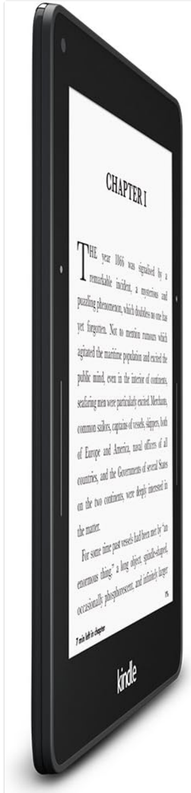
Image: Side profile of the Kindle Voyage E-reader, highlighting its thinness and flush screen design.

The Kindle Voyage features a sleek, thin design with a flush glass screen. Its compact size and lightweight construction make it comfortable for extended reading sessions.