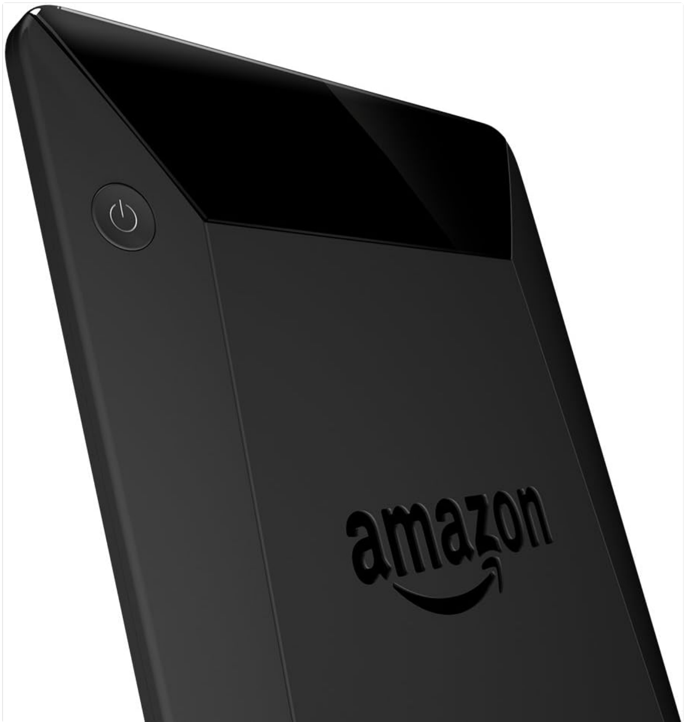
Image: Rear view of the Kindle Voyage, highlighting the power button and Amazon logo.