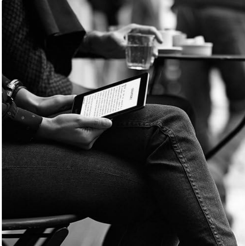
Image: A person reading the Kindle Voyage E-reader while seated outdoors, demonstrating its portability.

Supported content formats include: Kindle Format 8 (AZW3), Kindle (AZW), TXT, PDF, unprotected MOBI, PRC natively. HTML, DOC, DOCX, JPEG, GIF, PNG, BMP are supported through conversion.