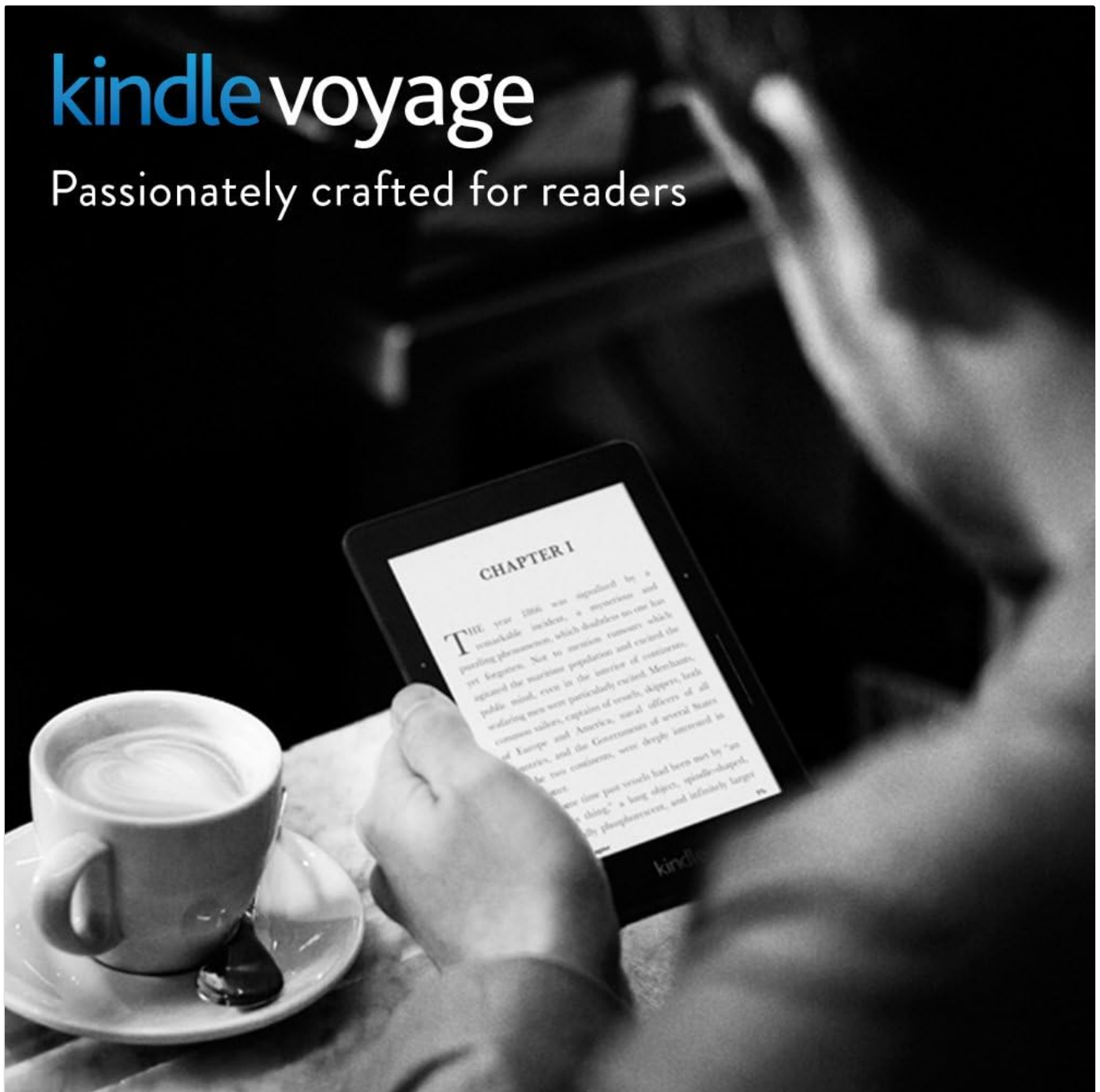
Image: A person holding the Kindle Voyage E-reader, engrossed in reading, with a coffee cup on a table.

The Kindle Voyage features a 6-inch E Ink Carta™ display with 300 ppi, designed to mimic the appearance of printed paper. It includes optimized font technology and a 16-level gray scale for clear text and images.