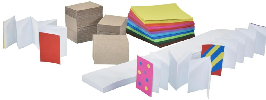
Image: An overview of the Sax Origa-Mini Accordion Book Kit components, including chipboard covers, accordion pages, and stacks of colorful origami paper squares.