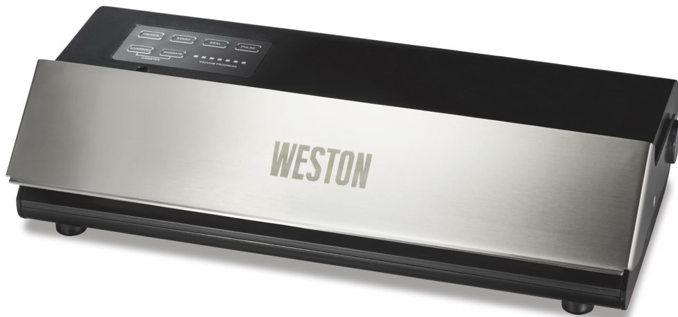
Image: Weston 65-0501-W Professional Advantage Vacuum Sealer in use, preserving various foods.