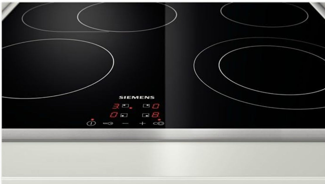
Figure 3: Touch Control Panel

The hob is operated using the touchControl panel located at the front. To activate a cooking zone, simply touch the corresponding sensor. Use the '+' and '-' symbols to adjust the heat level from 1 (lowest) to 9 (highest).