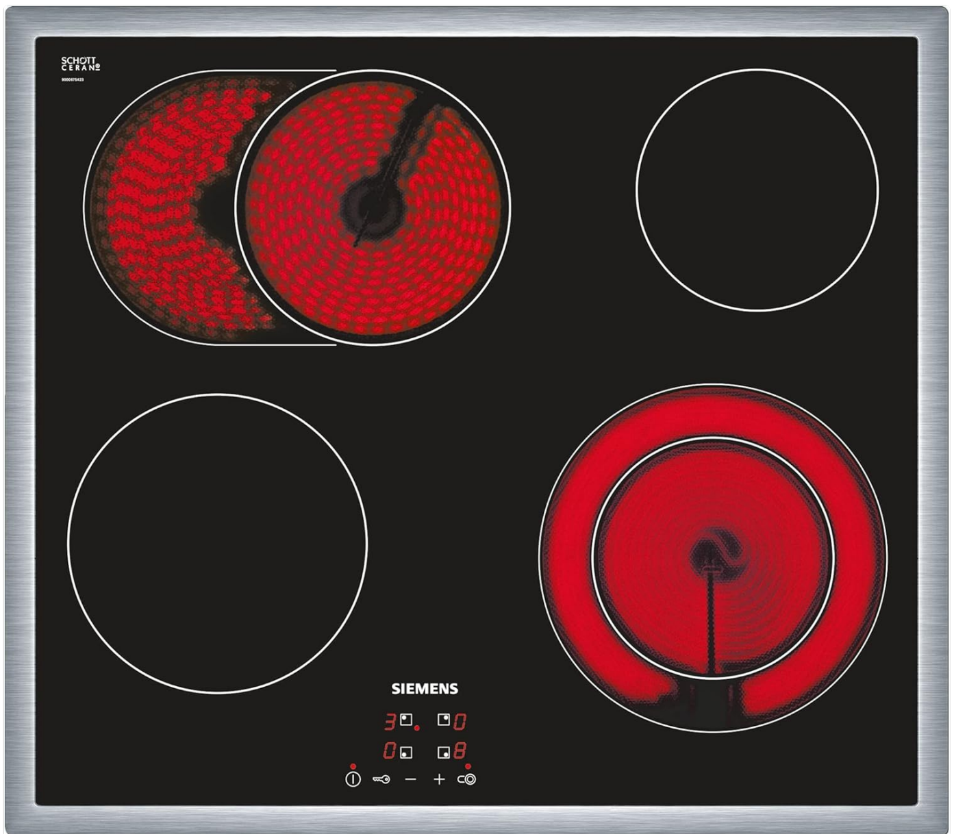
Figure 1: Siemens ET645HN17E Electric Hob

The Siemens ET645HN17E is a modern electric hob designed for seamless integration into your kitchen. Featuring a sleek glass-ceramic surface and intuitive touch controls, it offers efficient and precise cooking for a variety of dishes. Its durable construction and user-friendly features make it a reliable addition to any home.