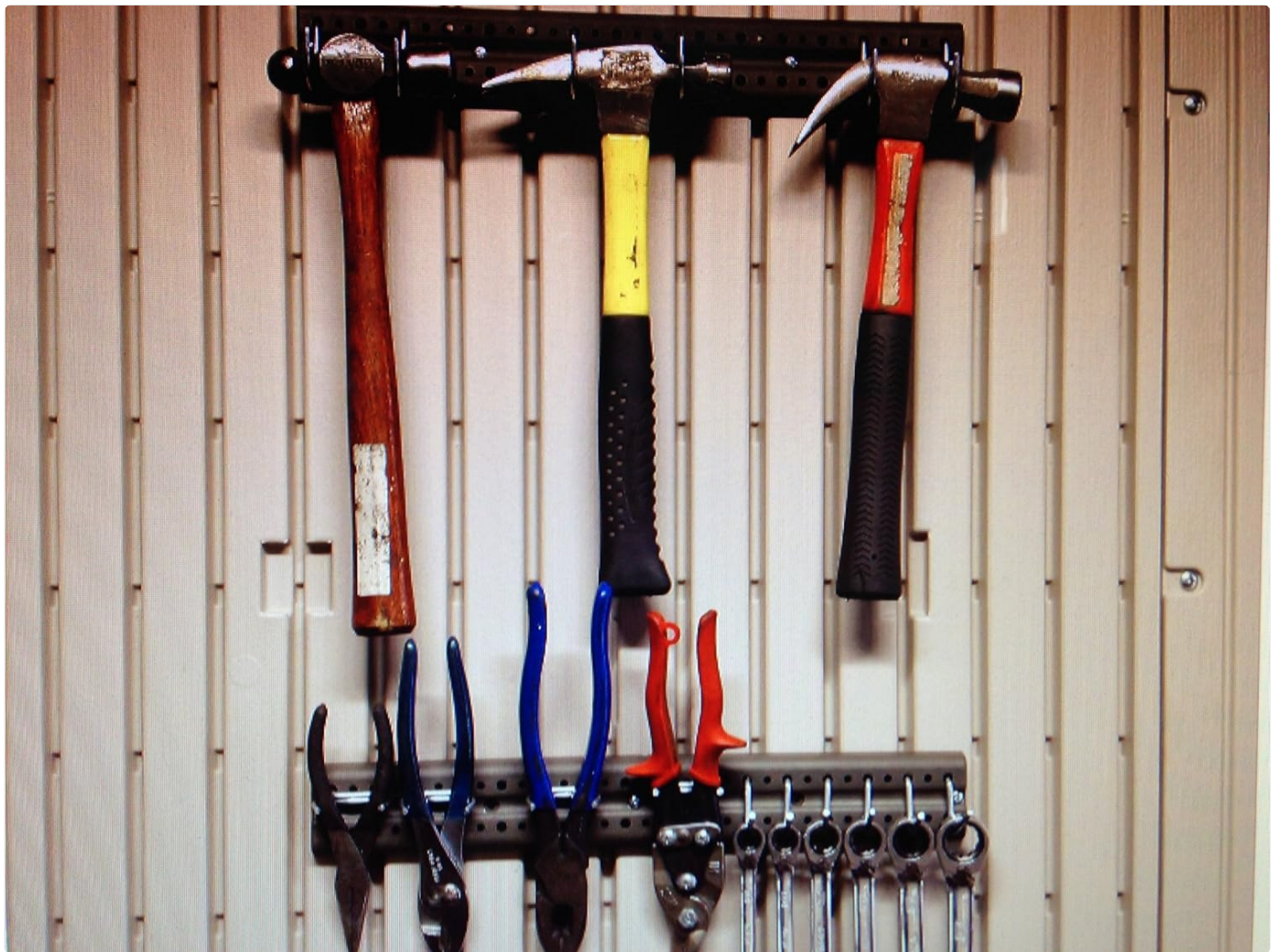
Figure 3.3: A wall-mounted organization system within the shed, holding various hand tools like hammers and pliers, illustrating efficient vertical storage.