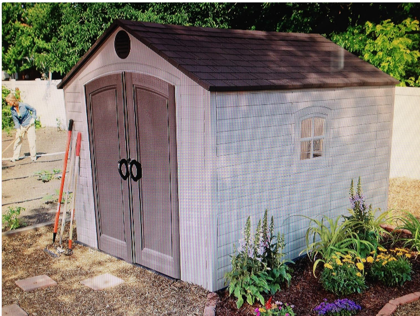
Figure 1.1: Exterior view of the Lifetime 10 x 8 Ft Outdoor Storage Shed, showcasing its design and size in a garden setting.