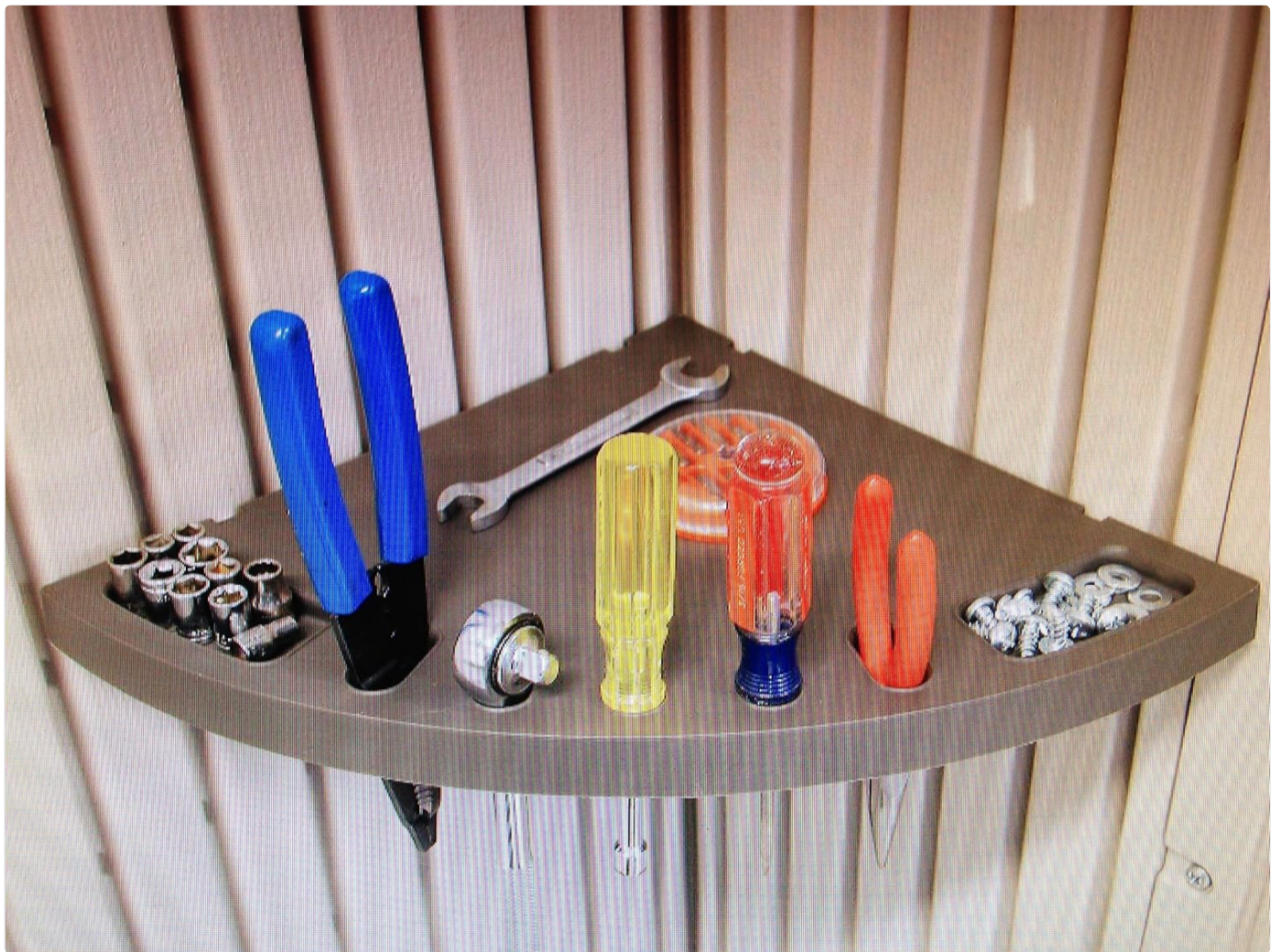
Figure 3.2: A corner shelf unit inside the shed, designed for organizing small tools and accessories.