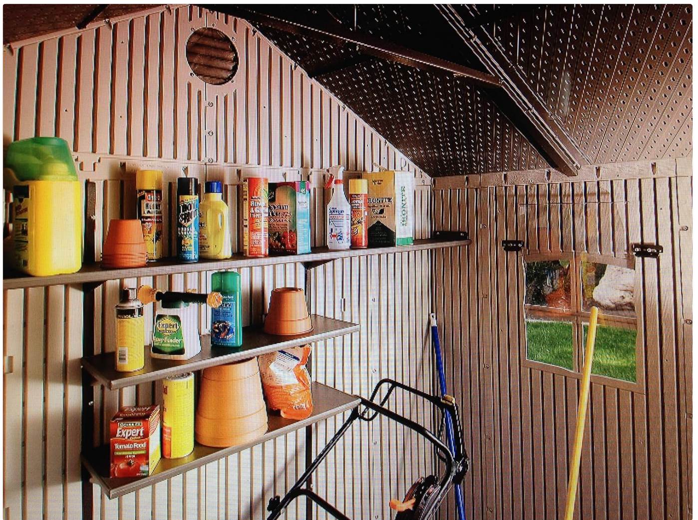
Figure 3.1: Interior view of the shed, showing multiple shelves stocked with various garden and household items, demonstrating the storage capacity.