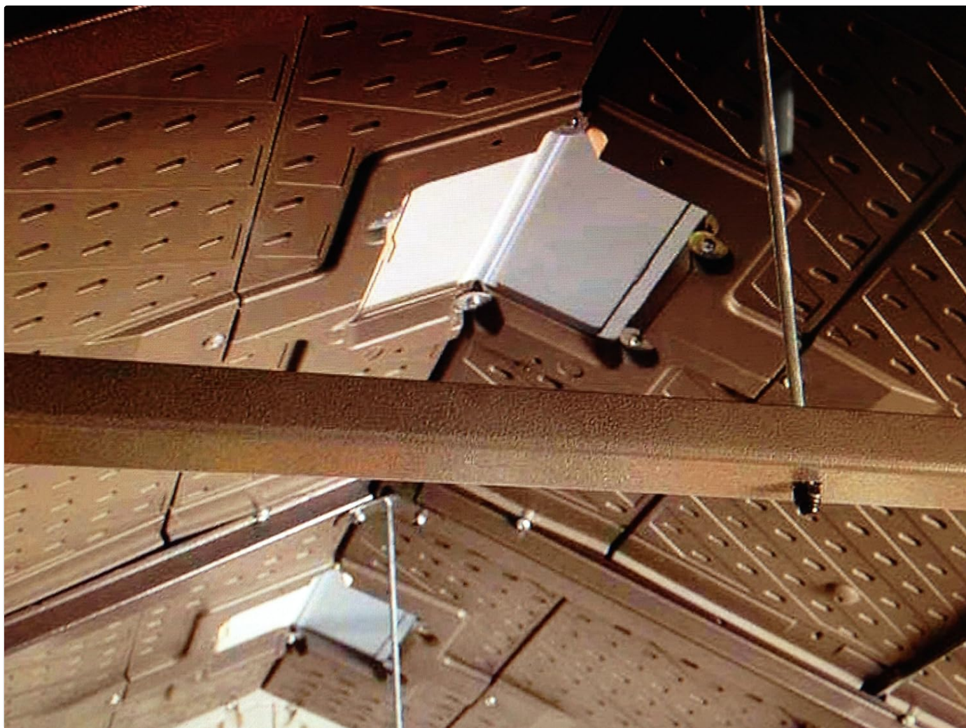
Figure 3.4: An interior view looking up at the shed's roof, highlighting the integrated skylights that allow natural light into the structure.