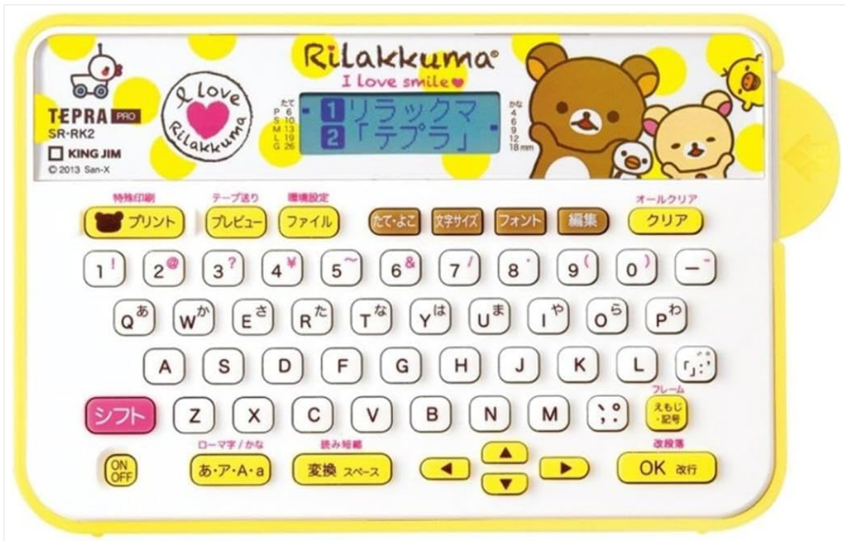
Figure 1.1: The King Jim Tepra PRO Rilakkuma SR-RK2 Label Writer. This image displays the device's full keyboard layout and integrated screen, highlighting its compact and user-friendly design.

This manual provides detailed instructions for the safe and effective use of your King Jim Label Writer Tepra PRO Rilakkuma SR-RK2. Please read this manual thoroughly before operating the device and retain it for future reference.