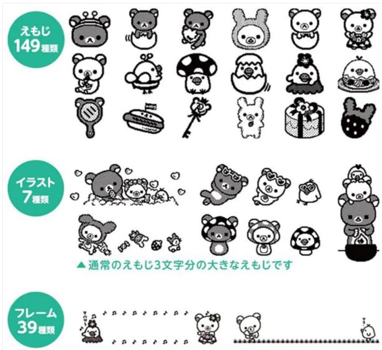
Figure 5.2: Available emoticons, illustrations, and frames. This image showcases a selection of the 149 emoticons, 7 illustrations, and 39 frames that can be used to customize labels.