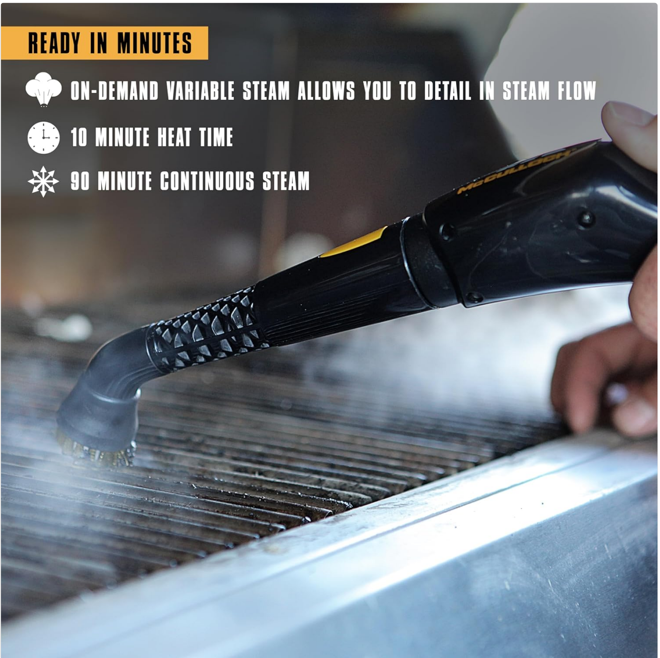
Figure 4: The MC1375 is ready for use in minutes.