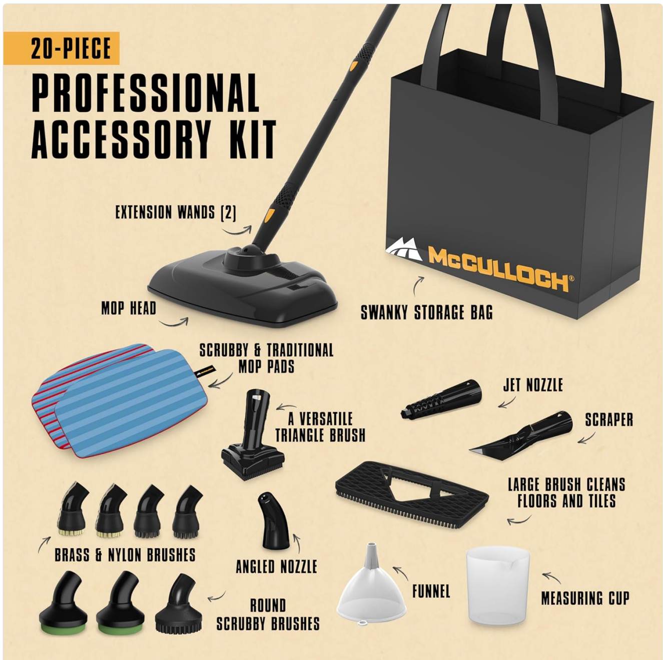
Figure 2: Detailed view of the 20-piece professional accessory kit.