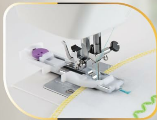
ONE STEP BUTTON HOLE

Image: Close-up views of the Auto Needle Threader mechanism and the One Step Button Hole foot in action.