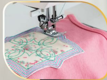
FREE ARM CIRCULAR STITCHING

Image: Close-up views of four special features: Zig Zag Width Adjustment, Feed Dog Drop for Embroidery, Triple Strength Stitch, and Free Arm Circular Stitching.