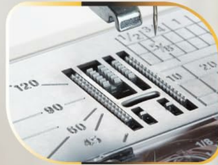
FEED DOG DROP FOR EMBROIDERY