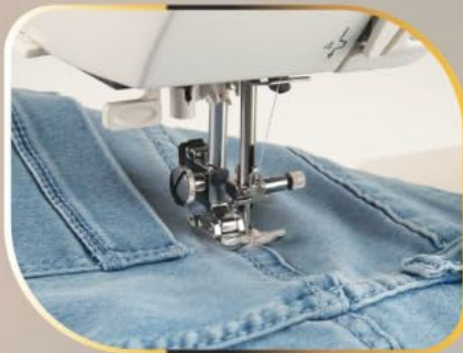
TRIPLE STRENGTH STITCH