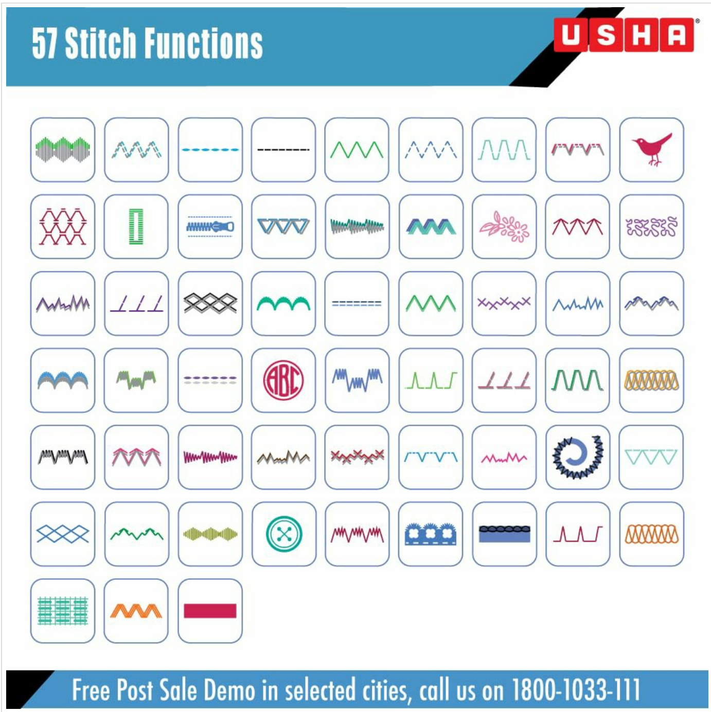
Image: A chart illustrating the 57 different stitch functions available on the Usha Janome Automatic Stitch Magic Sewing Machine, including utility stitches, decorative stitches, and embroidery patterns.

Your Usha Janome Automatic Stitch Magic Sewing Machine offers 57 stitch functions, allowing for a wide range of sewing projects. Use the stitch selector dial to choose the desired stitch pattern.