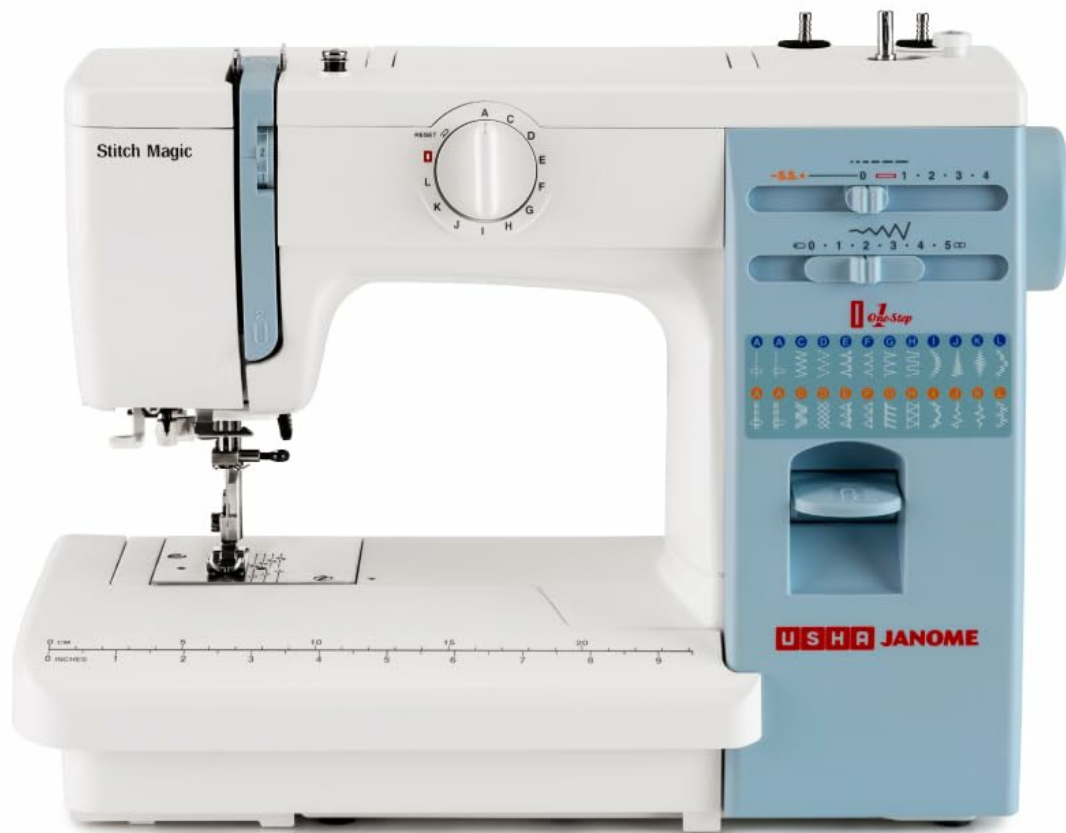
Image: Front view of the Usha Janome Automatic Stitch Magic Sewing Machine, white and blue in color, showcasing its compact design and stitch selection dial.