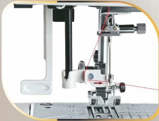
AUTO NEEDLE THREADER