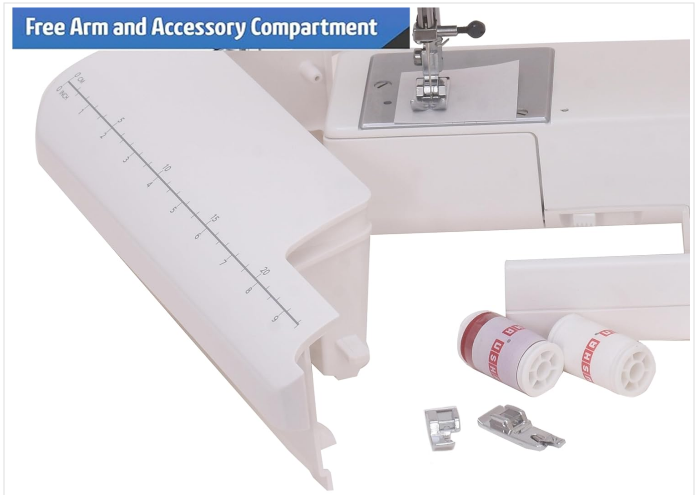
Image: The sewing machine with its extension bed detached, revealing the free arm for circular stitching and the accessory storage compartment. Two spools of thread and various presser feet are shown next to it.

The machine features a free arm for circular stitching and an integrated accessory compartment. To access the free arm, slide off the extension bed. The compartment stores various accessories.