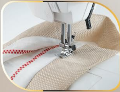
ZIG ZAG WIDTH ADJUSTMENT