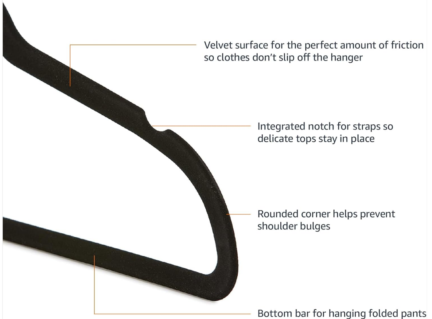
Figure 2.3: Detailed view of hanger features: velvet surface, integrated notches, rounded corners, and bottom bar.

Keep your clothes in great condition with these well-rounded hangers