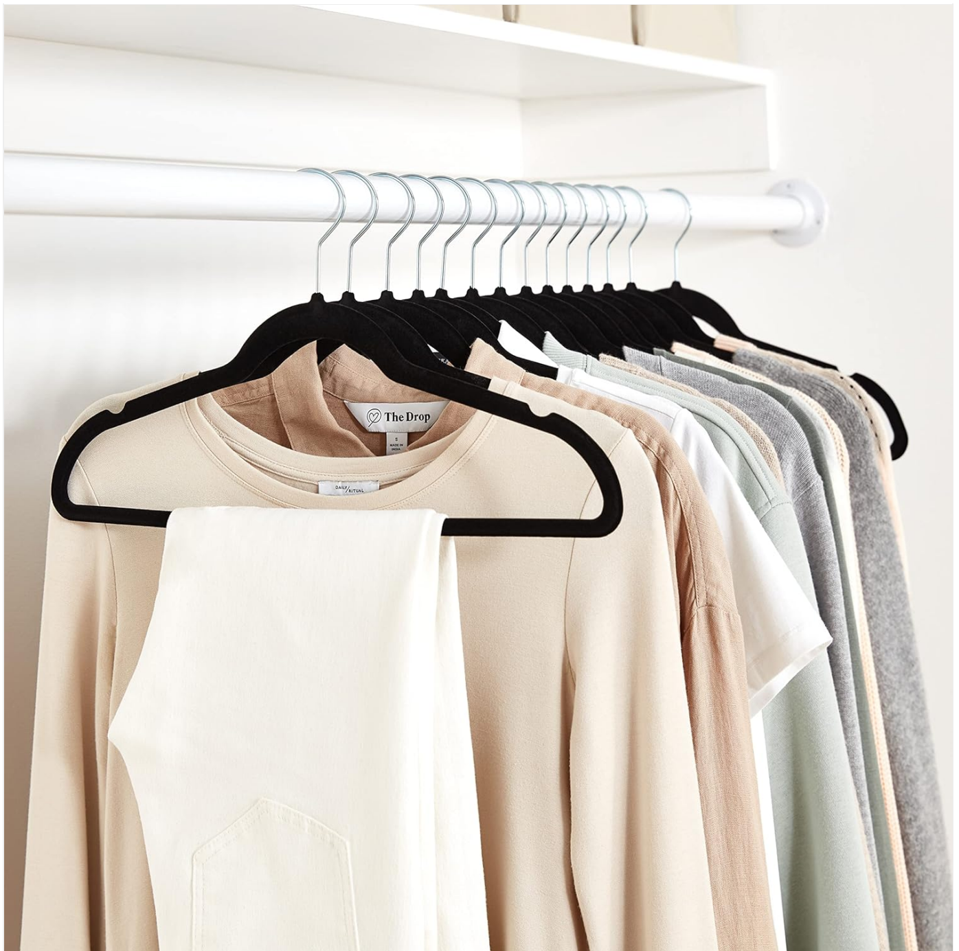
Figure 4.1: Hangers in use, showcasing their ability to organize and save space in a closet.