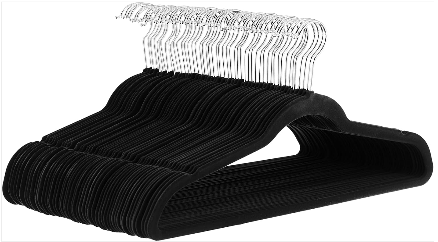
Figure 2.1: Amazon Basics Slim, Velvet, Non-Slip Suit Clothes Hangers (Pack of 50).