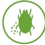
Dust Mite Debris