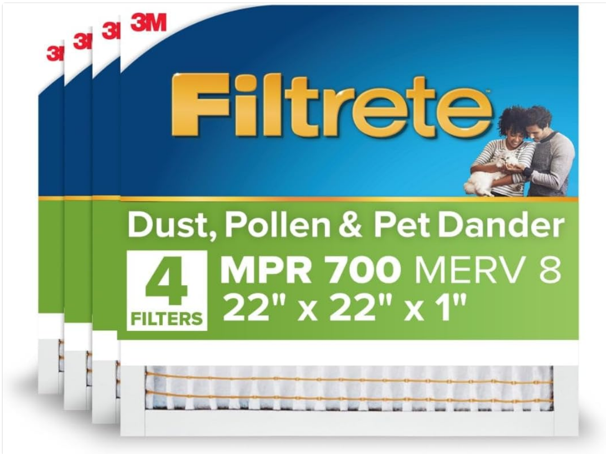
Image: Packaging for the Filtrete 22x22x1 AC Furnace Air Filter, showing a 4-pack with MPR 700 and MERV 8 ratings.