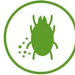
Dust Mite Debris