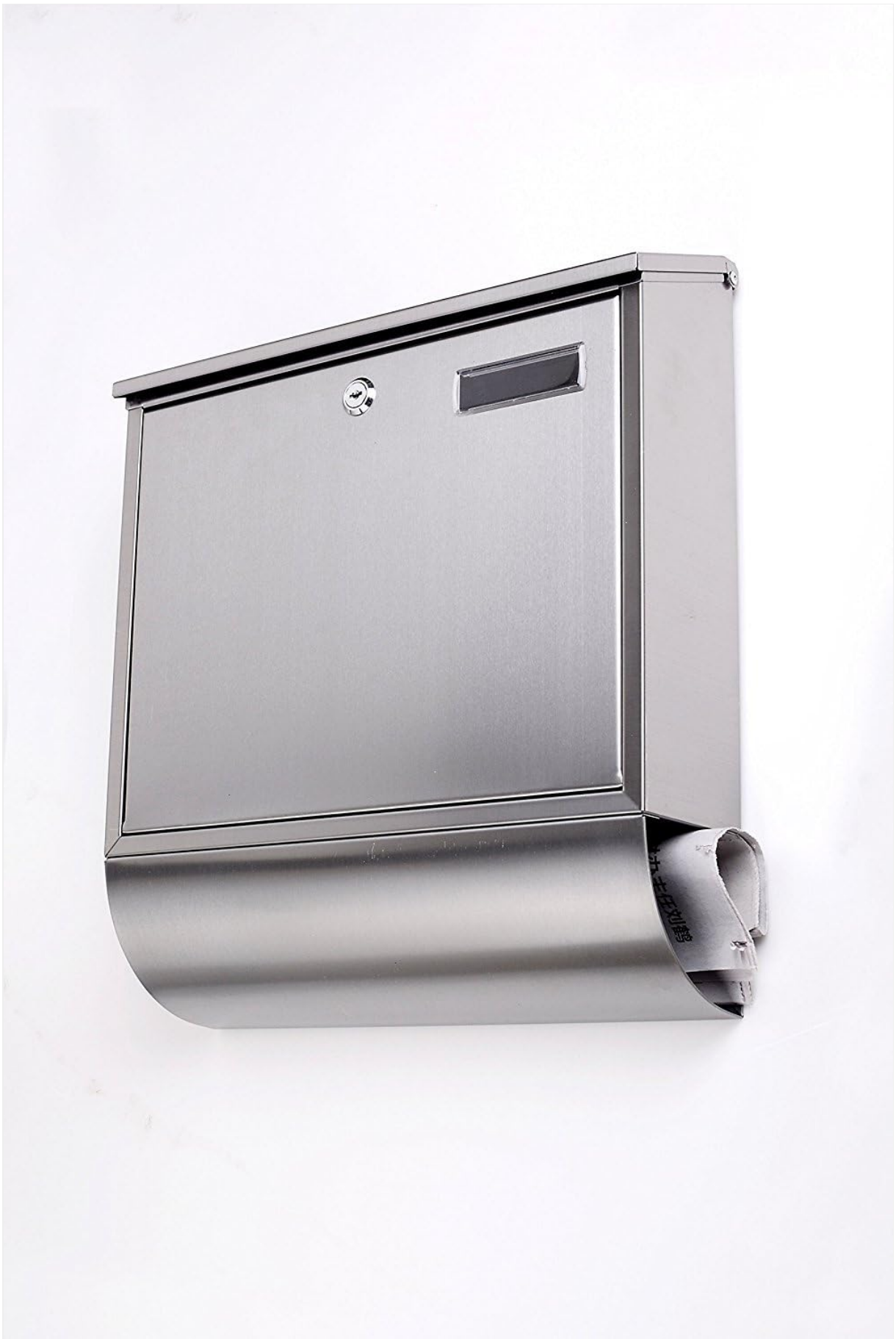
Image 5: Livarno Stainless Steel Mailbox with a newspaper in the integrated bottom holder.