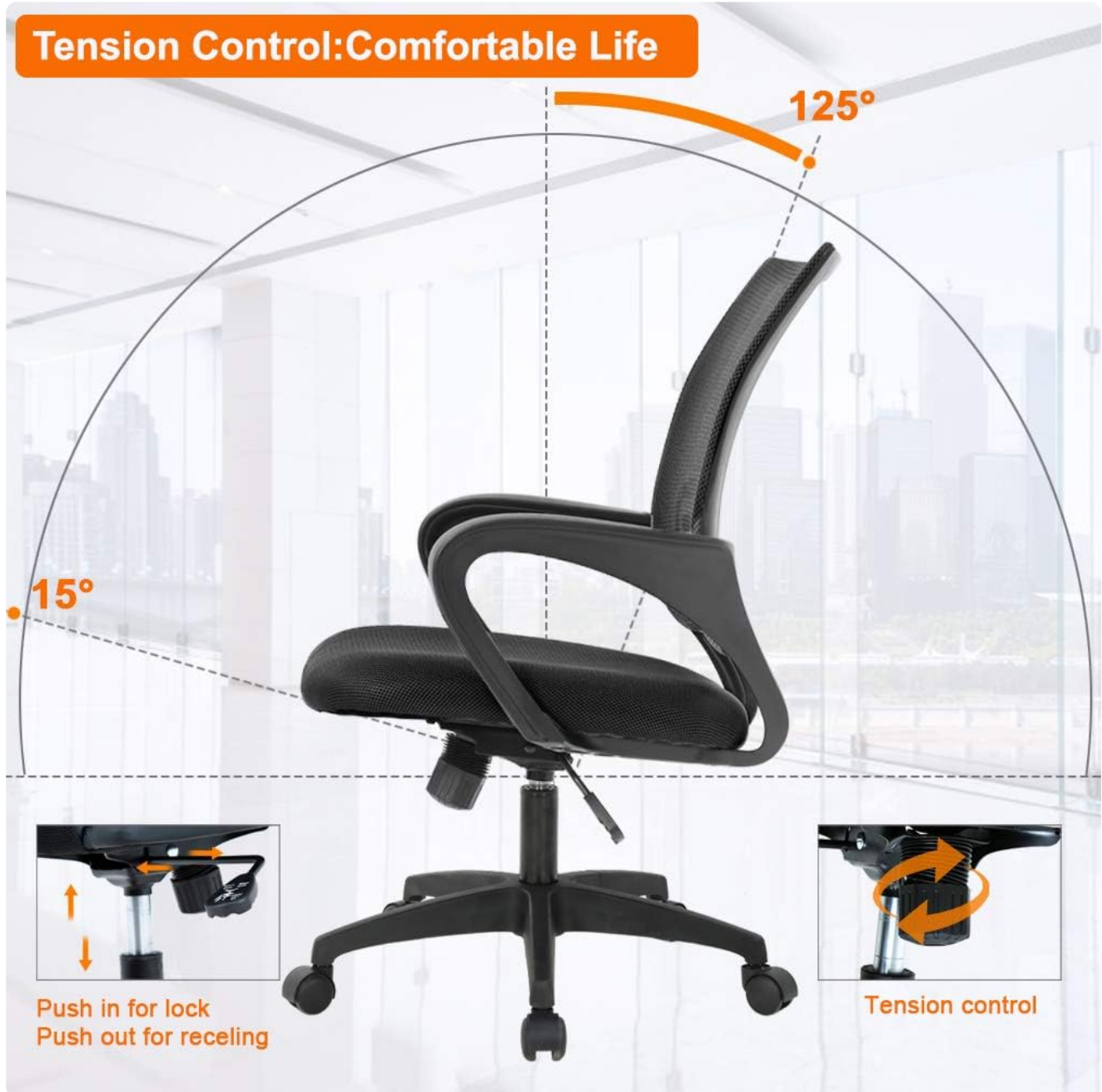
Figure 3: Illustration of tension control and gas lift mechanism.

The chair includes a tension control knob located under the seat. This knob allows you to adjust the resistance of the chair's tilt mechanism. Turn clockwise to increase tension (less recline) and counter-clockwise to decrease tension (more recline).