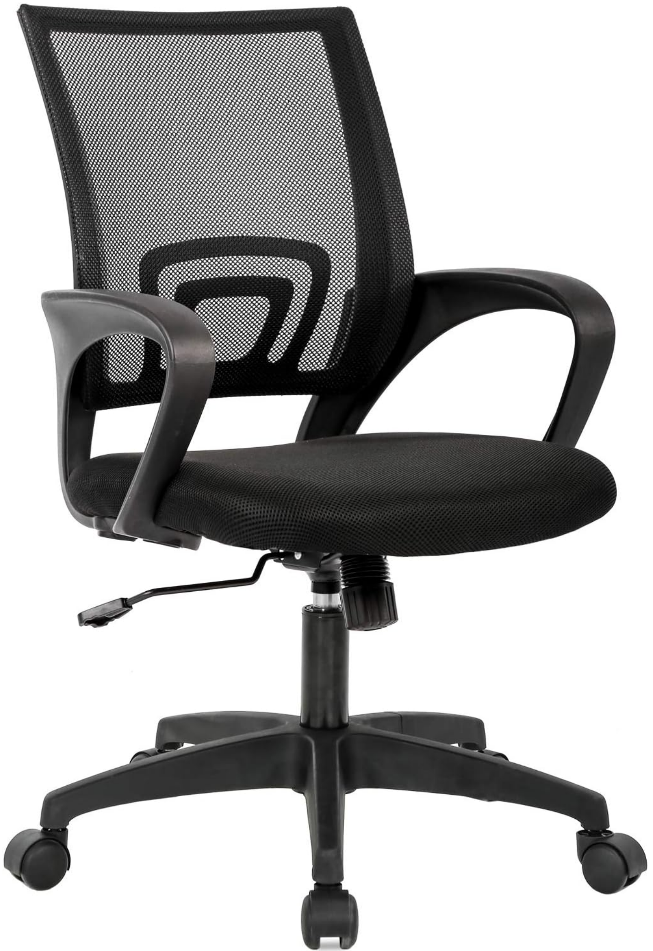
Figure 1: Front view of the BestOffice Ergonomic Desk Chair.