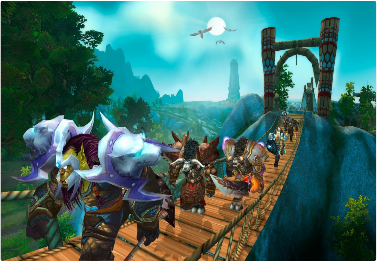
Image 4.1: Example of in-game exploration with multiple player characters.