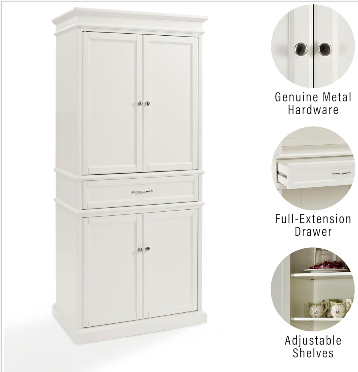
Figure 4: Key features of the Parsons Pantry Cabinet. This image highlights the quality of the metal hardware, the smooth operation of the full-extension drawer, and the flexibility offered by the adjustable shelves.

Caution: Avoid placing excessively heavy items in the drawer to ensure smooth operation and prevent damage to the glides or drawer bottom.