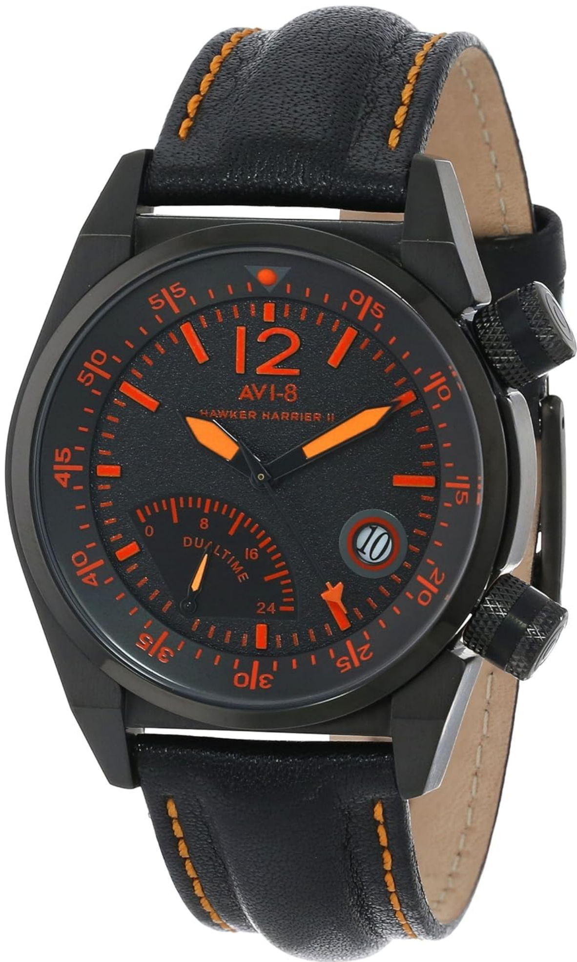
Figure 1: Front view of the AVI-8 AV-4004-03 Hawker Harrier II watch, showcasing the black dial with orange indices, dual