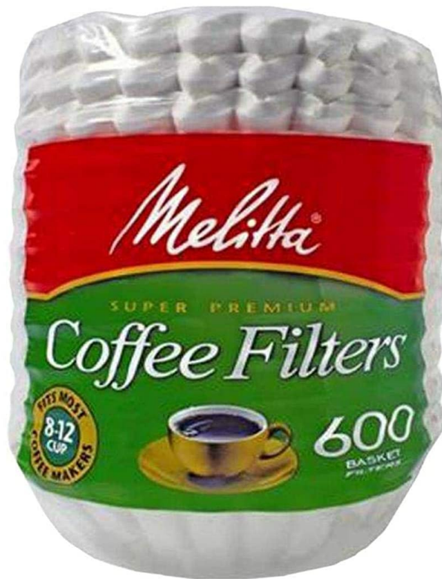
Image: Packaging of Melitta Basket Coffee Filters, 600 Count. The package features the Melitta logo, 'Super Premium Coffee Filters', and indicates compatibility with 8-12 cup coffee makers.