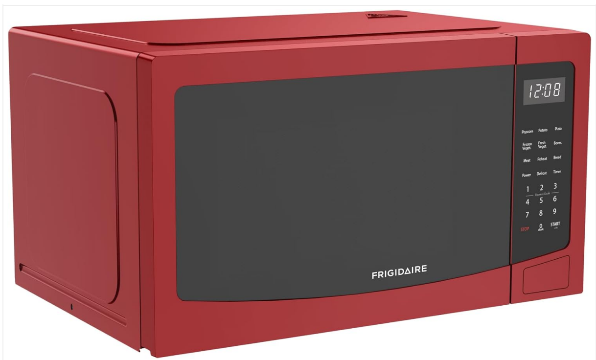
Figure 2.2: Angled view of the Frigidaire 1.1 cu. ft. 1000W Microwave, highlighting its compact yet spacious design suitable for countertops.