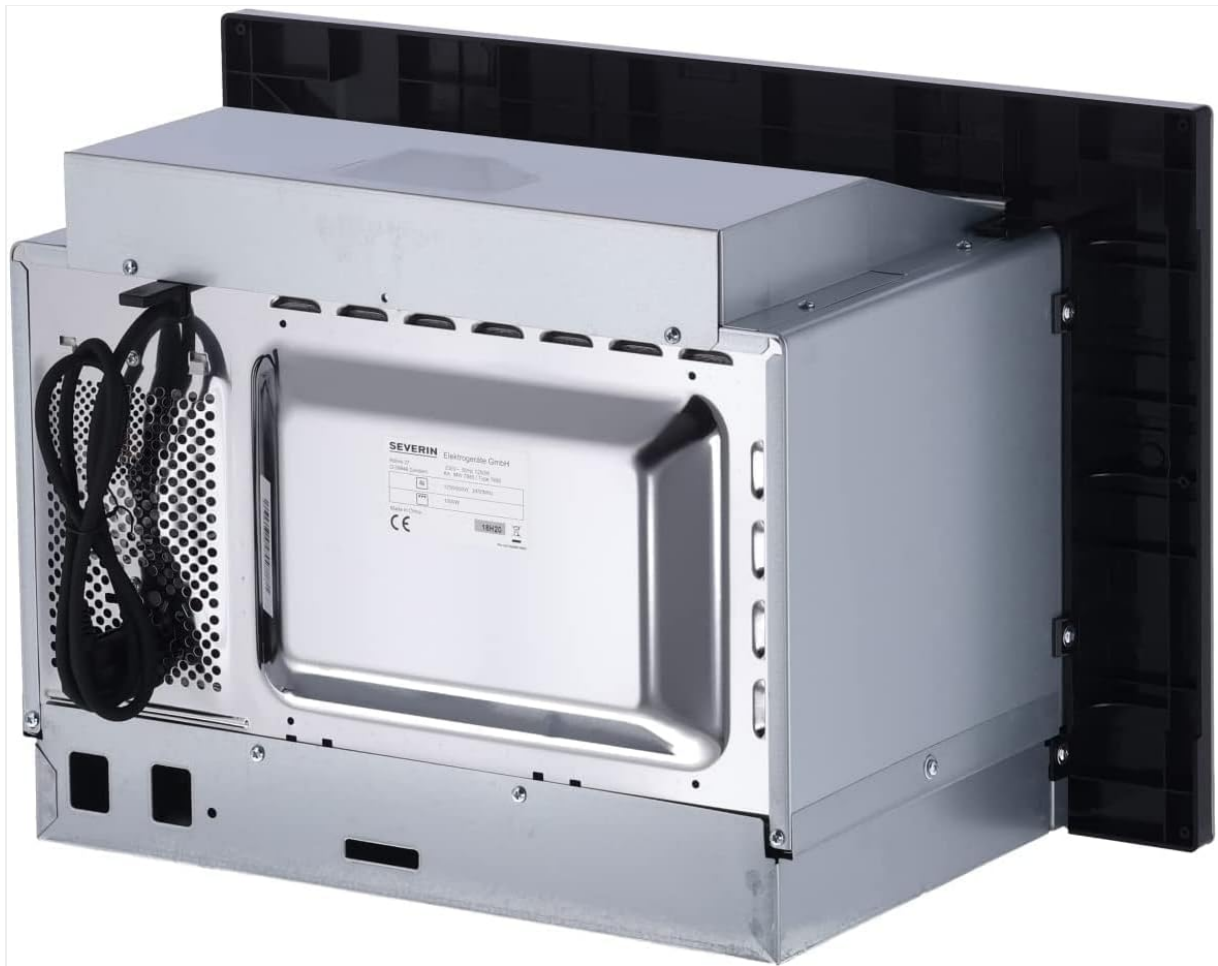
Rear view of the microwave, illustrating the ventilation openings and power cable connection, important for proper installation.