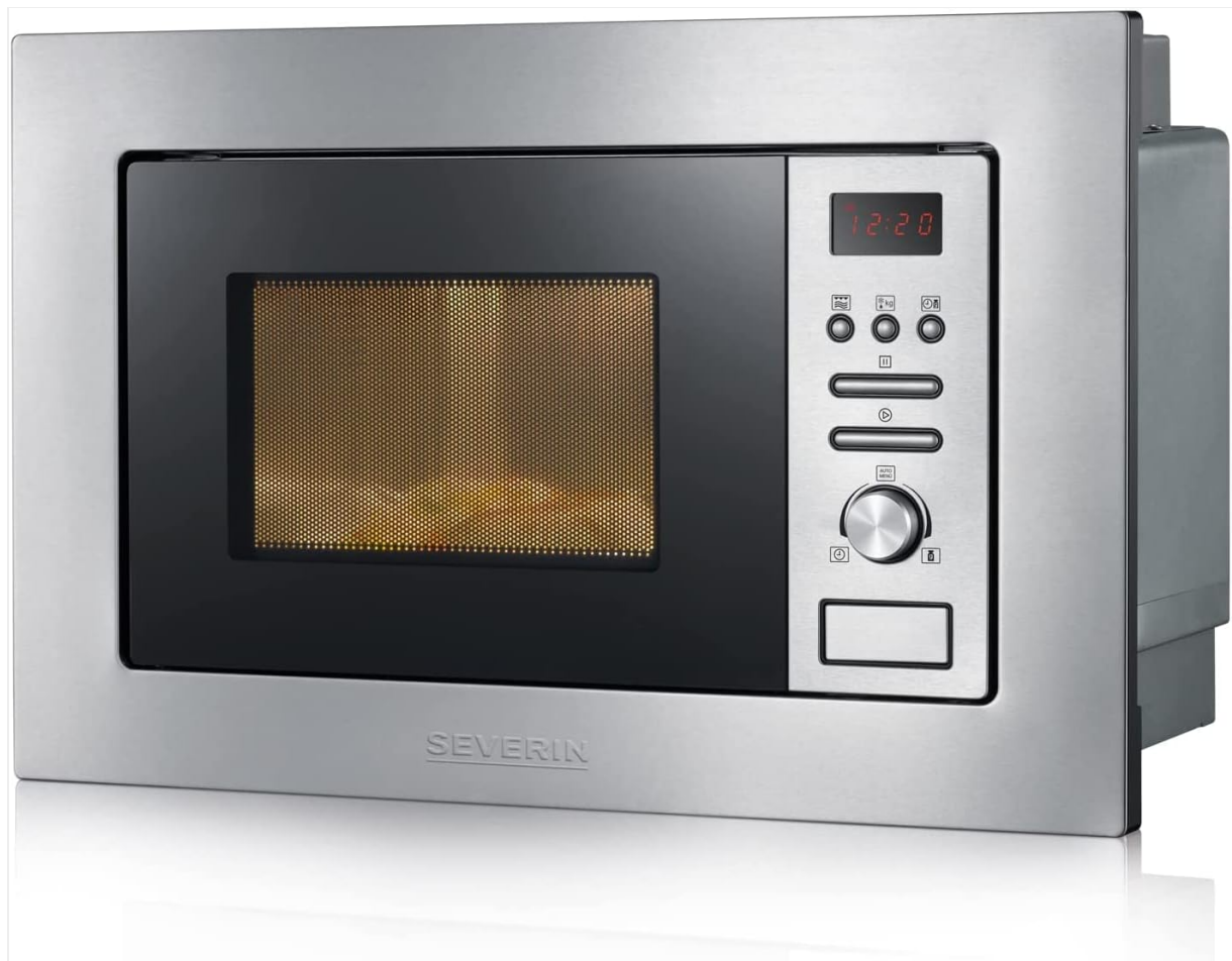
Front view of the SEVERIN MW 7880 built-in microwave, showcasing its stainless steel finish, digital display, and control panel.