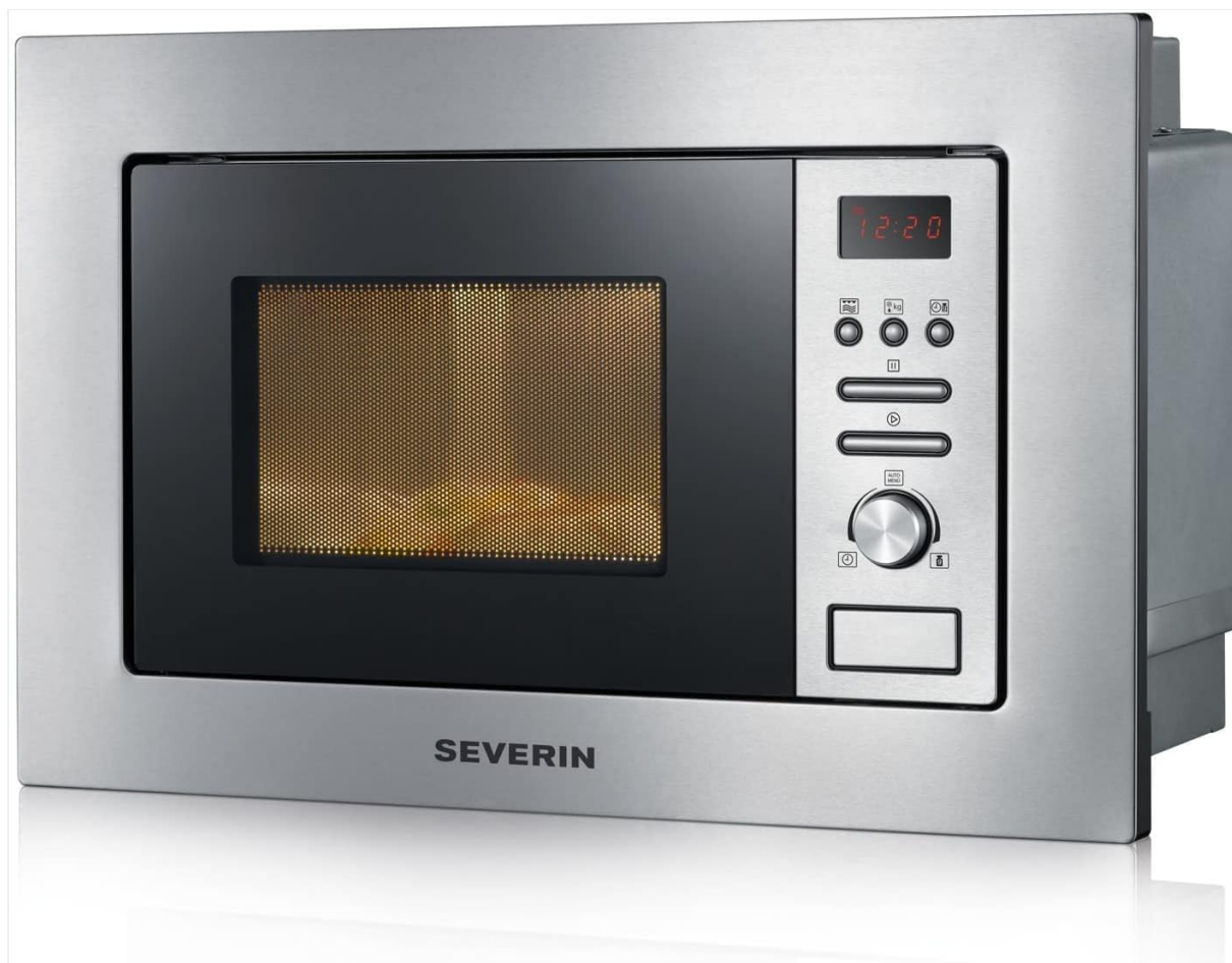
The interior of the microwave, featuring the removable glass turntable for even cooking.