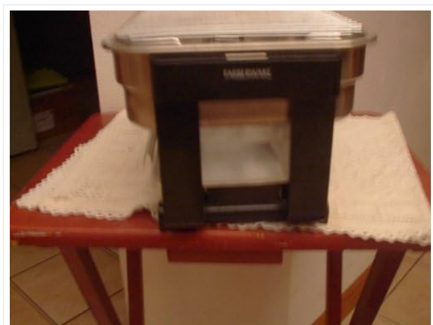
Figure 3: A side profile of the Farberware Electric Rotisserie Mini Grill, showing the main body and the integrated stand.