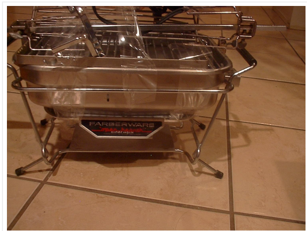
Figure 1: The complete Farberware Electric Rotisserie Mini Grill assembly, showcasing the main unit, grill grate, and rotisserie components including the spit rod and forks. This view highlights the overall compact design and the integrated stand.

Your Farberware Electric Rotisserie Mini Grill comes with several key components designed for versatile cooking. Familiarize yourself with each part before operation.