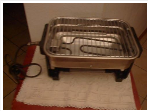
Figure 4: Another top view, providing a clearer look at the heating element's design and placement within the grill base.

This view helps in understanding the appliance's footprint and height.