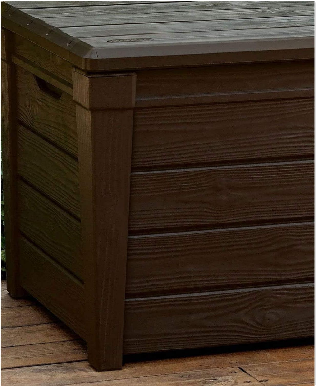
Figure 4.3: A close-up view of the integrated lockable feature on the deck box, allowing for secure storage.