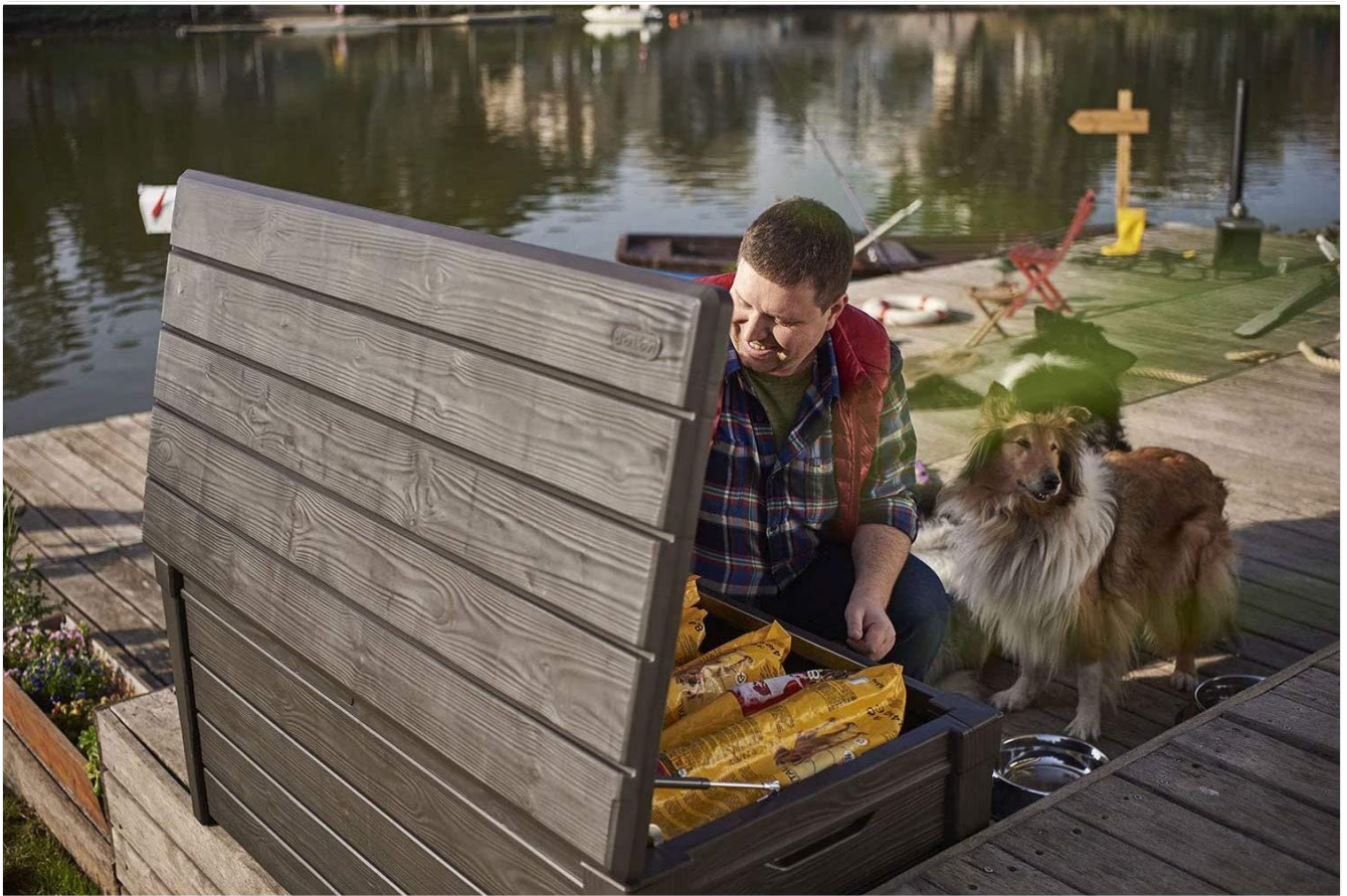
Figure 4.2: The Keter Brightwood Deck Box being used as a comfortable and sturdy outdoor bench.

The robust construction of the Brightwood Deck Box allows it to serve as a sturdy bench, capable of supporting up to 804 pounds. This dual functionality makes it a practical addition to any patio, backyard, or garden setting.