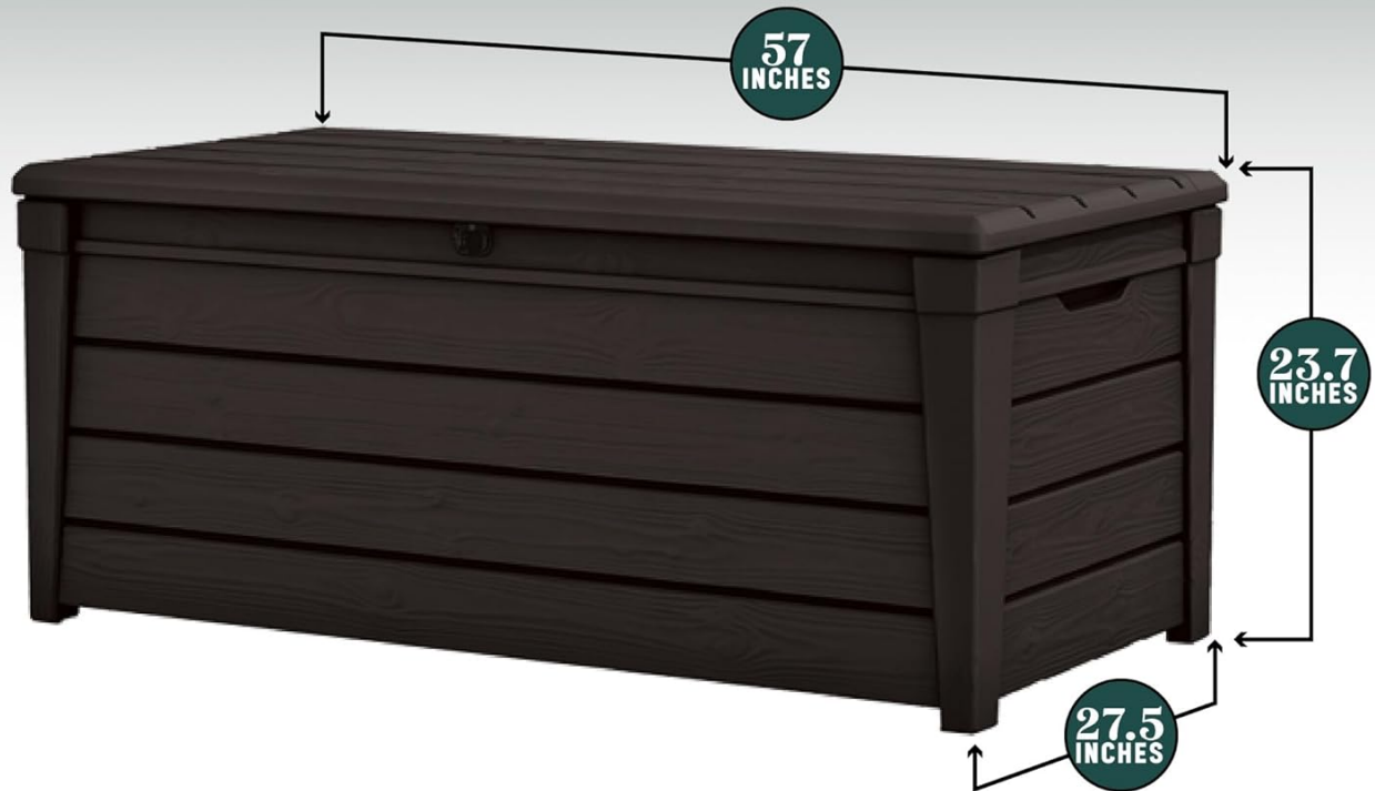
Figure 2.2: Detailed dimensions of the Keter Brightwood 120 Gallon Deck Box, including capacity, interior dimensions, and weight.