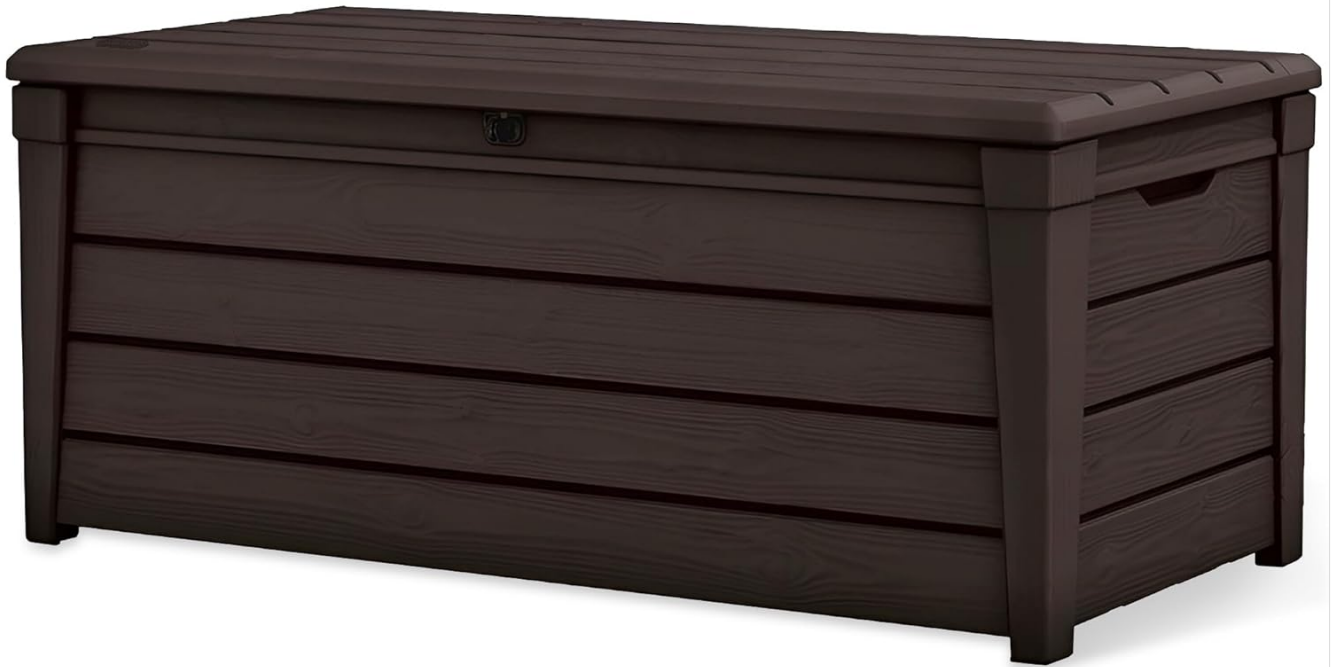
Figure 2.1: The Keter Brightwood 120 Gallon Outdoor Storage Deck Box, showcasing its brown, wood-look texture.