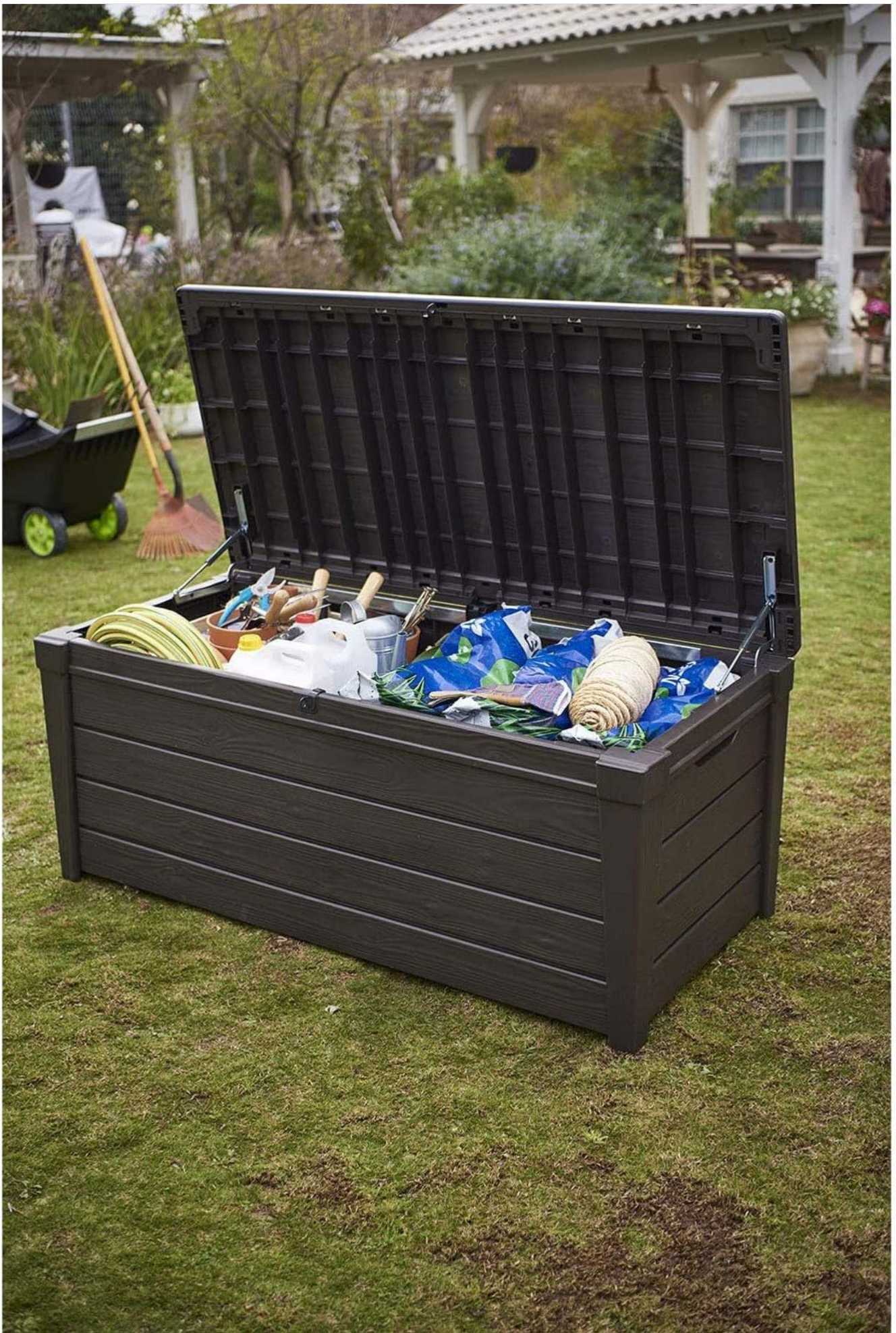
Figure 4.1: The deck box with its lid fully open, revealing ample storage space for various outdoor items.