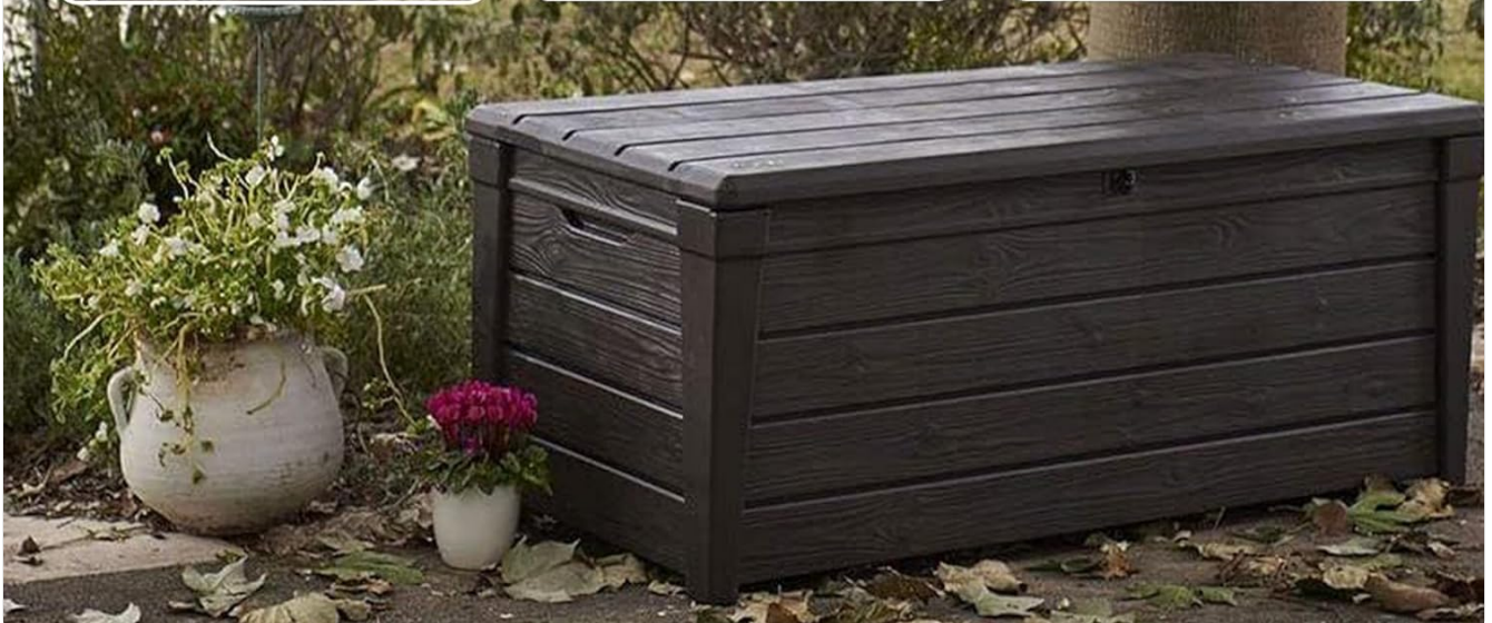
Figure 2.3: Key features of the deck box: all-weather durability, hydraulic pistons for easy opening, and a lockable mechanism (lock not included).