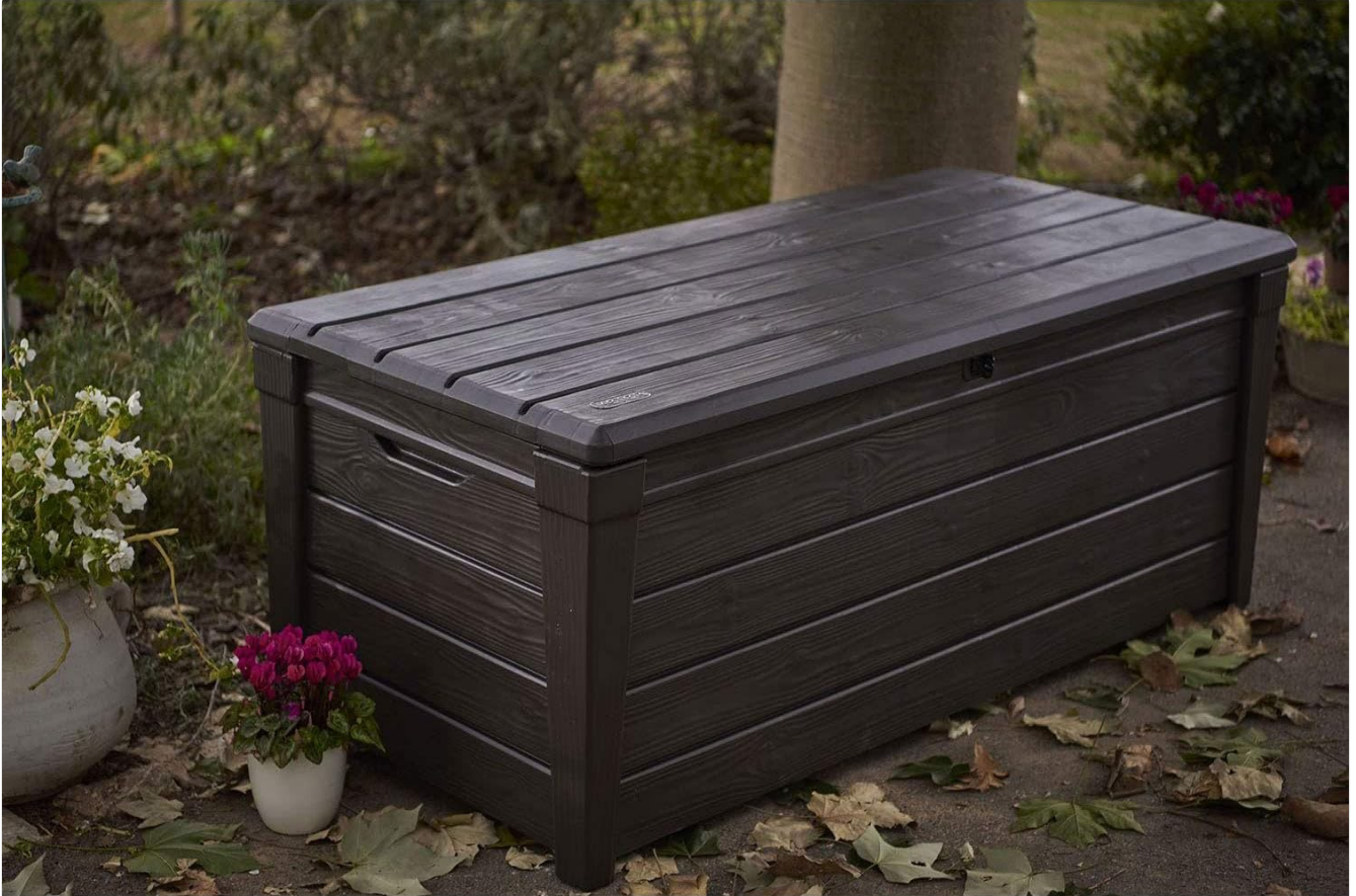
Figure 5.1: The Keter Brightwood Deck Box seamlessly integrated into an outdoor environment, demonstrating its weather-resistant design.