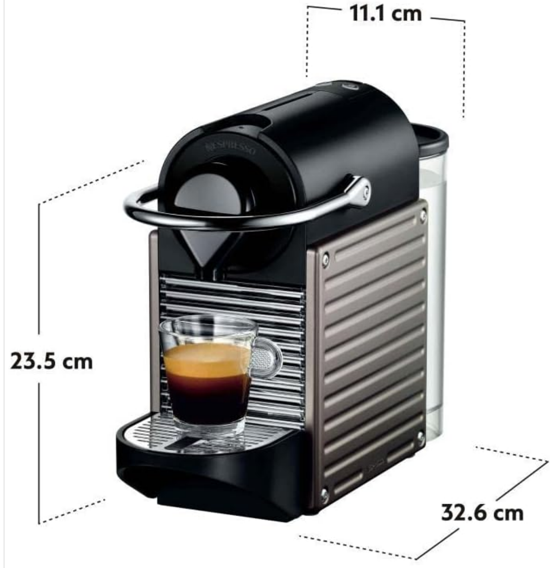
Image 7.1: Nespresso Pixie Titan coffee machine with its compact dimensions (width, height, depth) indicated.