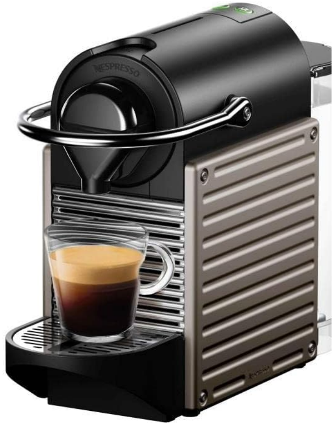
Image 4.1: Nespresso Pixie Titan machine brewing coffee, highlighting Espresso and Lungo functions.