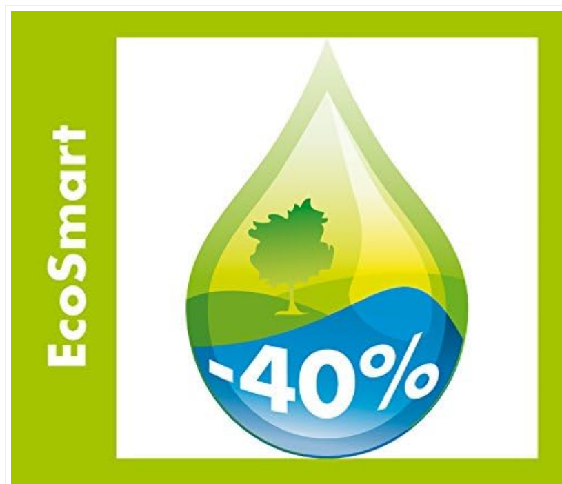
Image 4.4: The EcoSmart symbol, highlighting the product's water-saving capability.

The hand shower is equipped with Hansgrohe EcoSmart technology, which reduces water consumption by up to 40% compared to conventional showers, without compromising the showering experience. This feature is integrated into the hand shower and operates automatically.