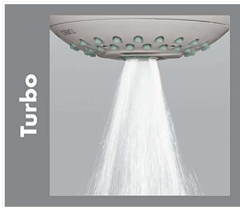
Image 4.3: The Turbo spray setting, delivering a strong, focused stream of water.