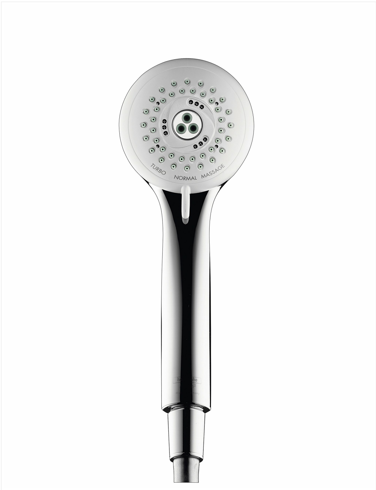
Image 1.1: The Hansgrohe Marin Multi 3-Jet Hand Shower, showcasing its chrome finish and ergonomic design.