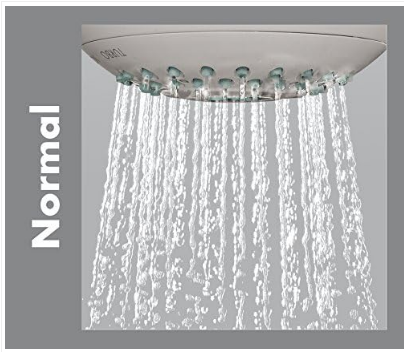
Image 4.1: The Normal spray setting, providing a wide and even water distribution.