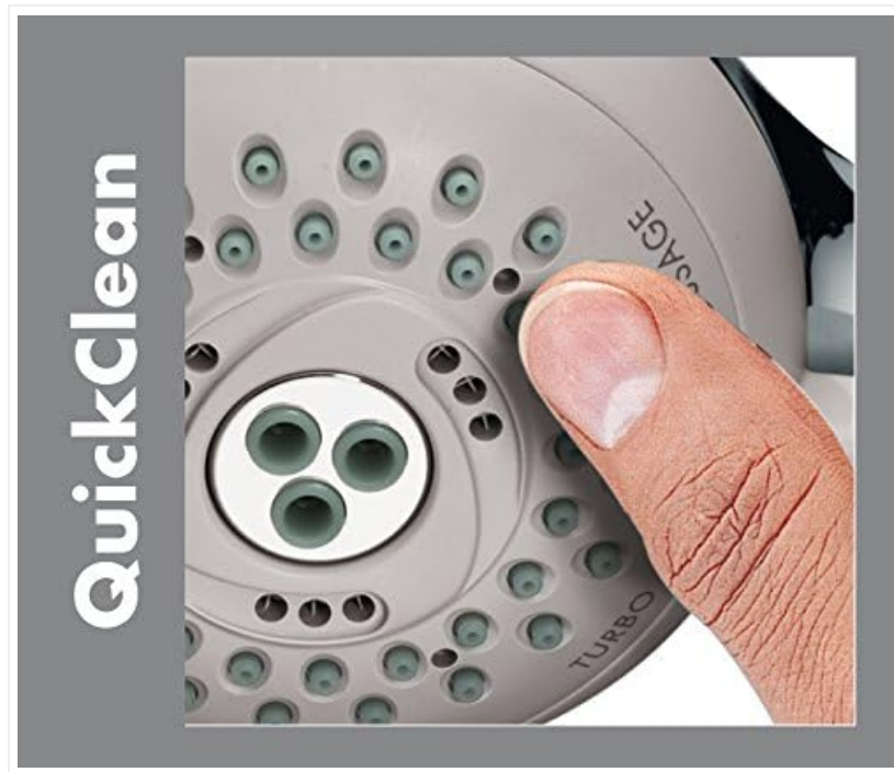
Image 5.1: Demonstrating the QuickClean function, where limescale can be easily wiped off the flexible silicone nozzles.

easily removed by gently rubbing them with your finger. This ensures a consistent spray pattern and extends the product's lifespan.