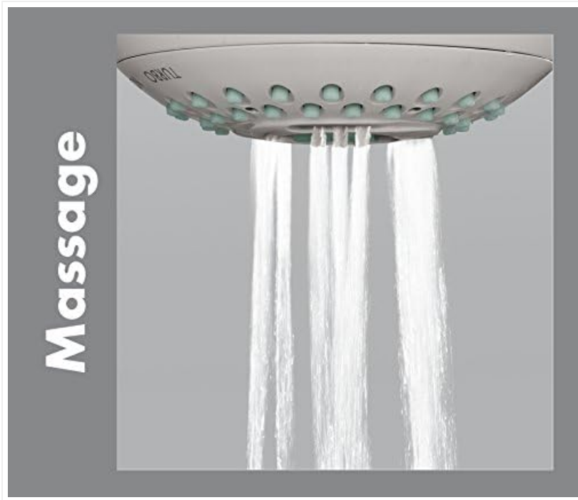
Image 4.2: The Massage spray setting, featuring concentrated water jets for a stimulating effect.