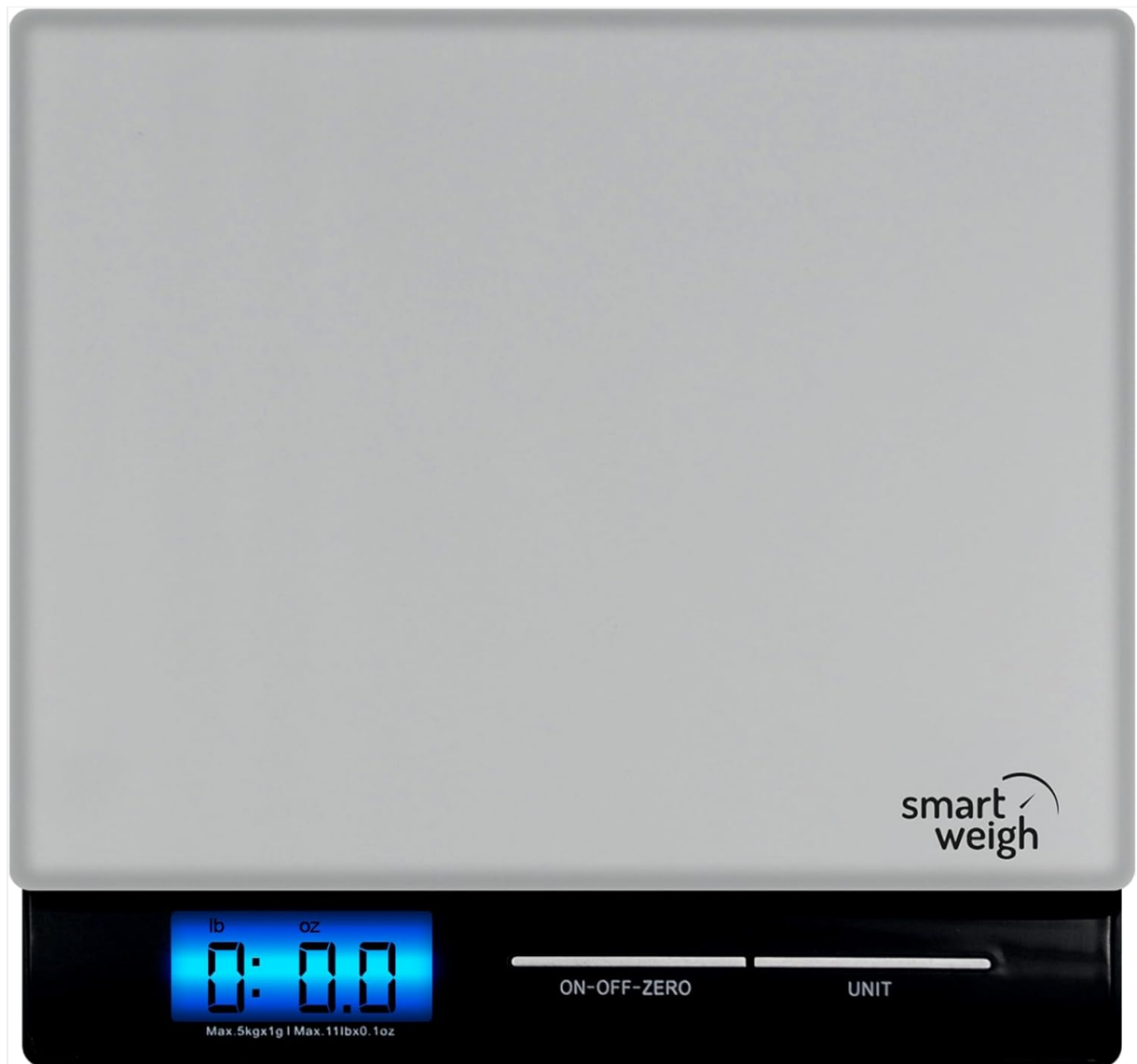
Figure 4.1: Top view of the Smart Weigh PL11B scale, displaying the tempered glass platform and digital readout.