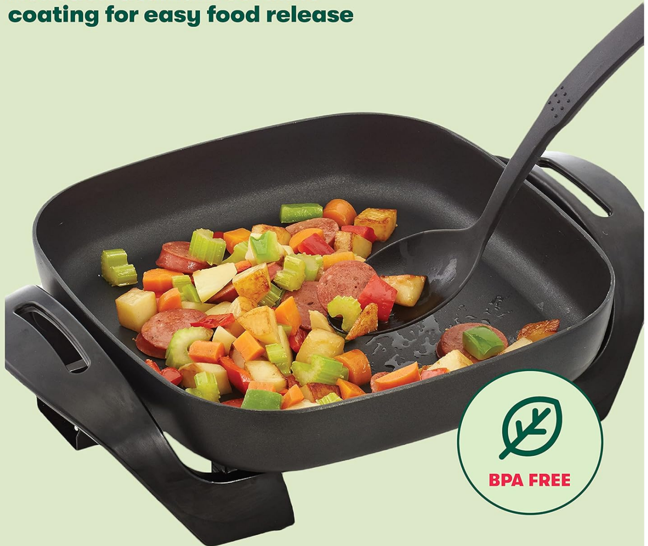
Figure 5: The skillet features a durable nonstick titanium ceramic coating, ensuring easy food release and quick cleanup. It is PTFE and PFOA free.

Nonstick titanium ceramic coating for easy food release