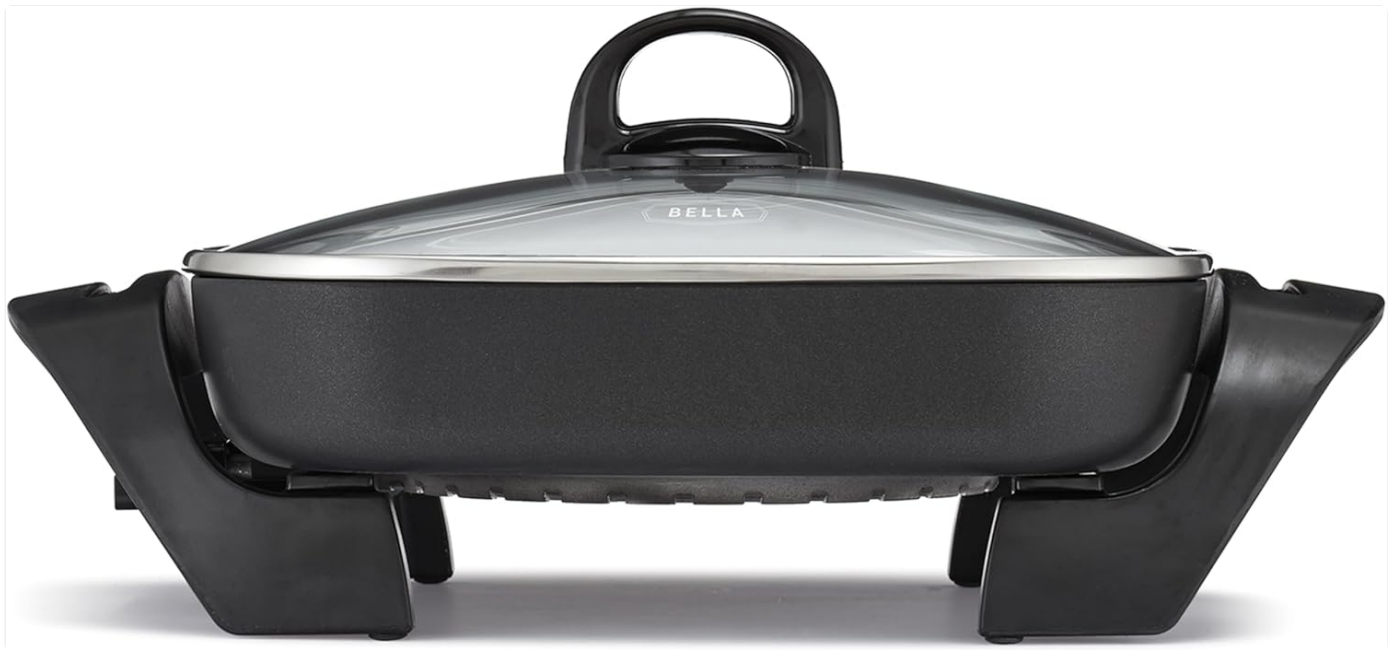
Figure 1: The BELLA Electric Skillet features a durable cast aluminum base and a tempered glass lid. It is designed for versatile cooking.