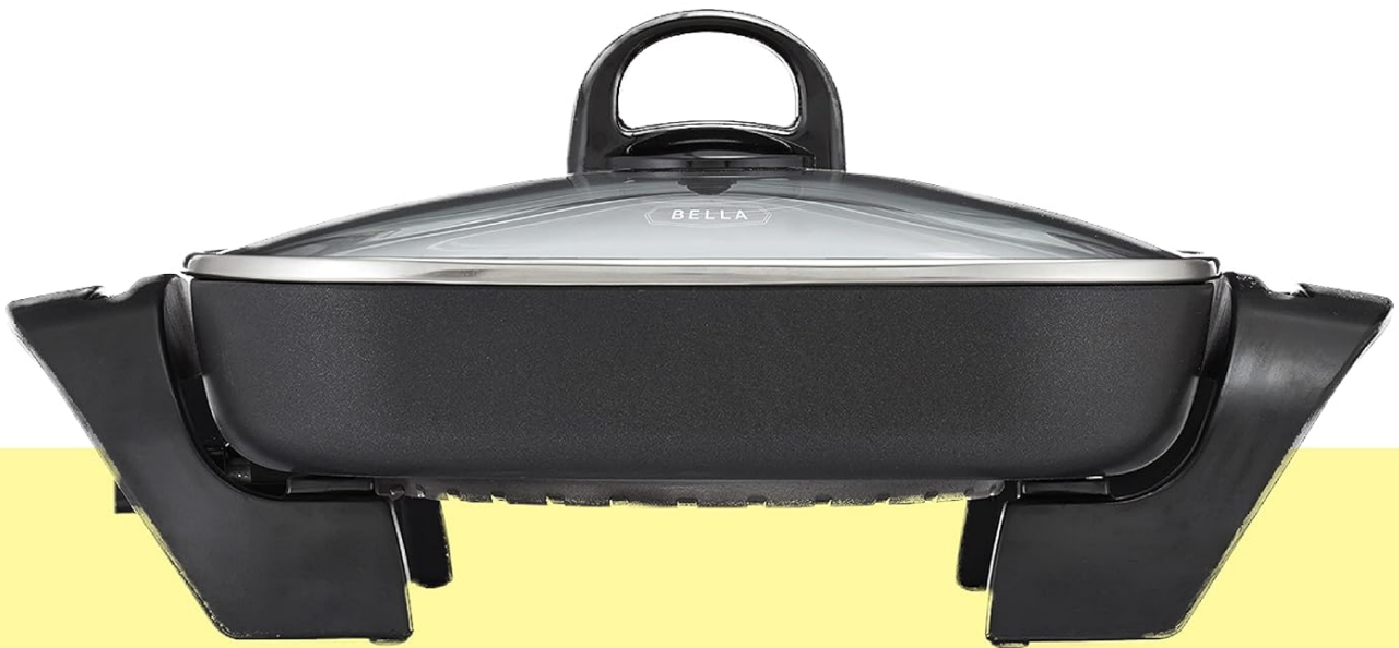
Figure 4: The dishwasher-safe tempered glass lid allows for easy monitoring of food without lifting the lid, retaining heat and moisture.