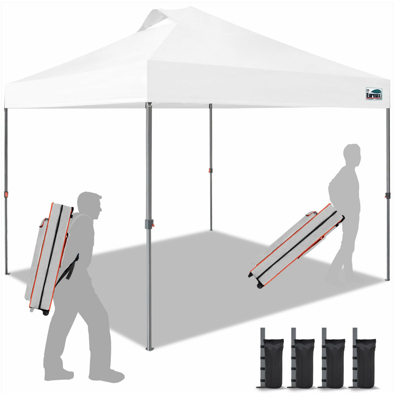
Figure 1: Fully assembled Eurmax NOMATTER 10x10ft Pop Up Canopy Tent.