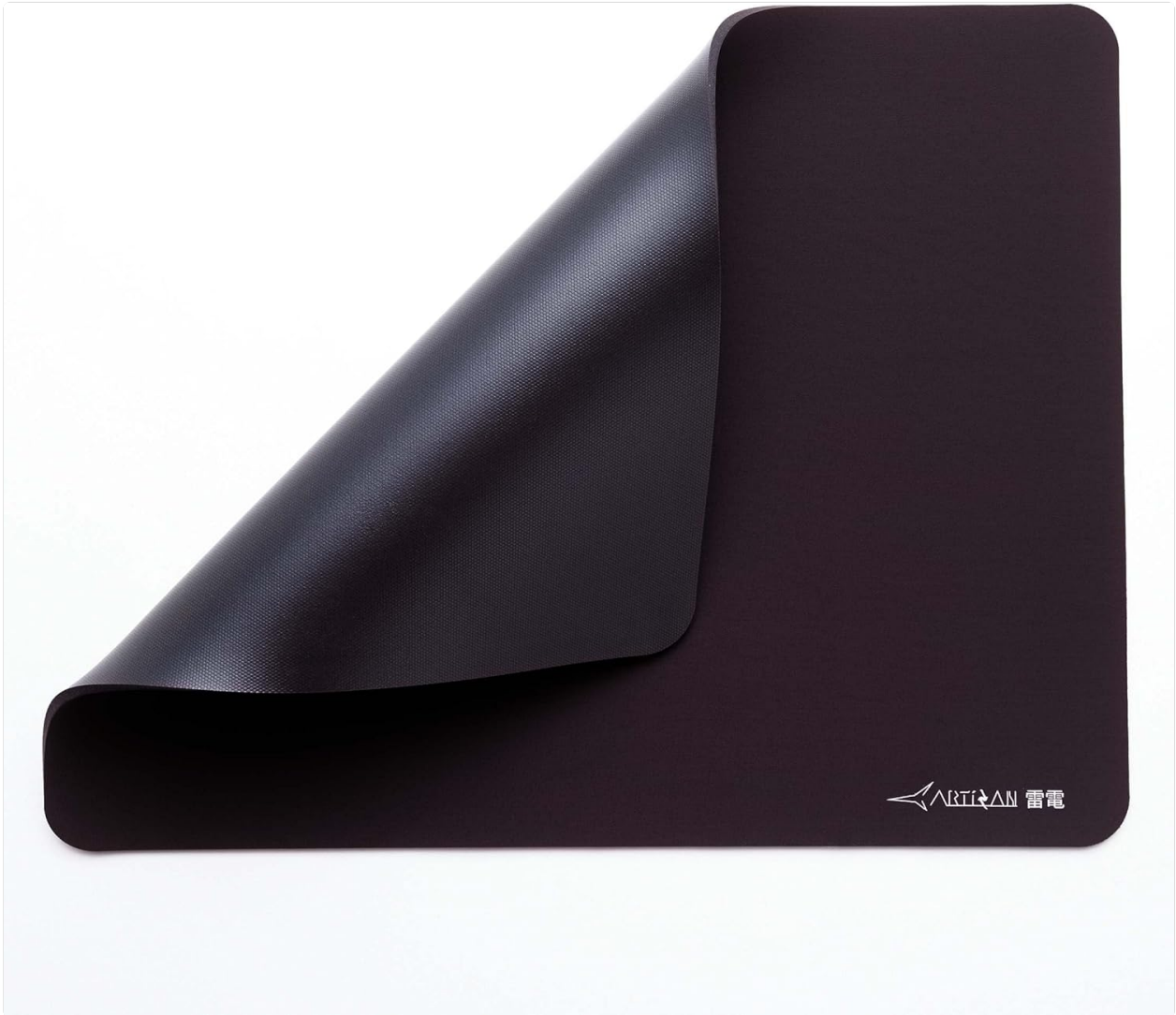
Figure 2: Back view of the Artisan Raiden Classic MID M mouse pad, illustrating the non-slip rubber base that grips the desk surface.

The non-slip base ensures the mouse pad remains stationary on your desk, preventing unwanted shifts during intense gaming or work sessions.